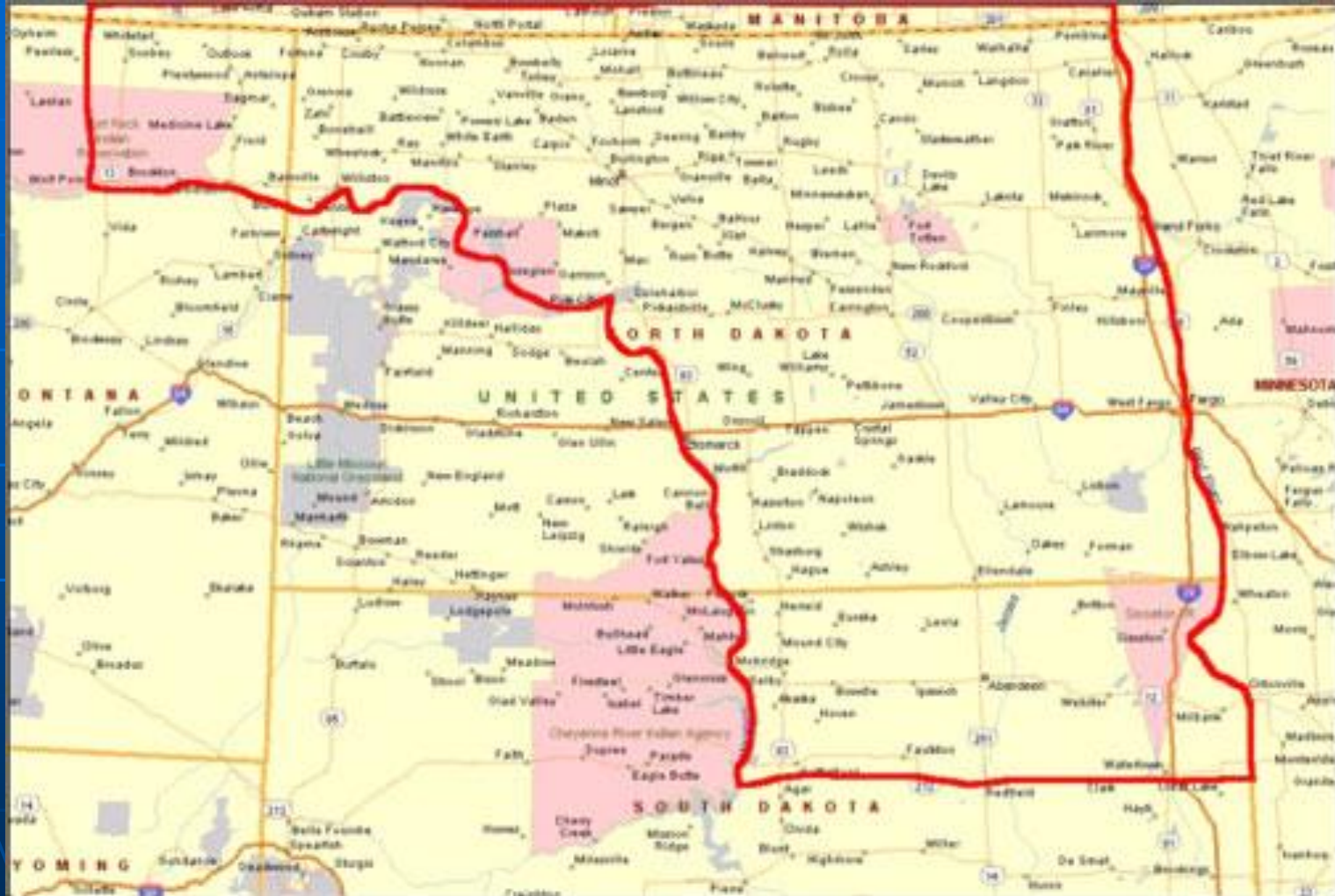
Land claimed by the Little Shell Pembina Band. Includes most of North Dakota and parts of Montana, South Dakota and Manitoba.