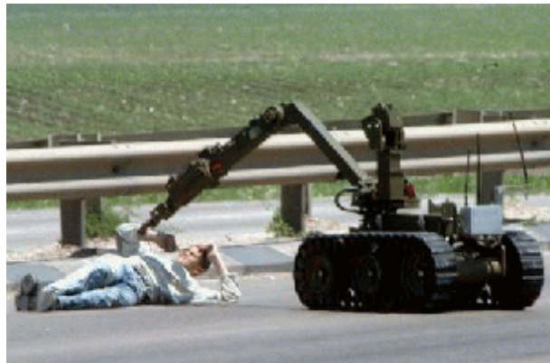
Israeli bomb technicians search a suspect using a robot following the premature explosion of his suicide bomb on May 8, 2002 near Megiddo, Israel.

This document is FOR OFFICIAL USE ONLY and BOMB TECHNICIAN SENSITIVE. It is disseminated to personnel serving as active duty bomb technicians in public safety Improvised Explosive Device Disposal and military Explosive Ordnance Disposal units for reference purposes only. Further dissemination is restricted by the FBI, Bomb Data Center.