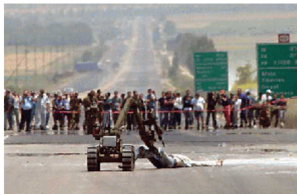
Israeli bomb technicians search a suspect using a robot following the premature explosion of his suicide bomb on May 8, 2002 near Megiddo, Israel.