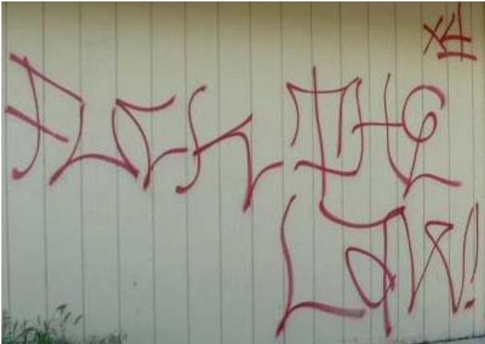
Photo: Example of anti-law graffiti in Yakima, Washington Source: Yakima Police Department