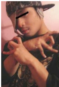
Photo: Tiny Rascal Gangsters member, Seattle, Washington

The most active Southeast Asian Gangs for Seattle, Washington are the Tiny Rascal Gang (TRG), SouthEnd Asian Gangsters (SAG), Young Oriental Troop (YOT), Oriental Fantasy Boys (OFB), and Little Ruthless Boyz (LRB).