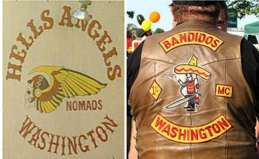
Photo: Hells Angels Nomads Patch, Washington and Bandidos Colors

OMGs, primarily the Hells Angels, in Canada use their national and international connections to other club chapters to transport Canadian hydroponic marijuana, which is commonly called British Columbia Bud or BC Bud and MDMA (3,4-methylenedioxymethamphetamine), also known as Ecstasy, through Washington and into other states. Much like other DTOs, OMGs will use street gangs as drug suppliers and retail distributors. After the State of Texas, which has the highest membership of Bandidos OMG, Washington State is second in the nation for Bandido gang membership