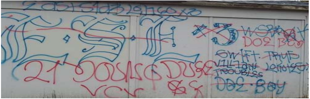
Photo: Examples of gang graffiti in Yakima County, Washington

Gangs statewide perpetrate violence ranging from assaults to murders, burglaries to home invasion robberies, drive-by shootings, sexual assault, torture, intimidation, kidnapping, weapons trafficking, and prostitution.