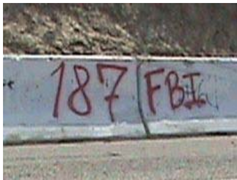
Photo: Graffiti at Colville Tribe. 187 denotes California Penal Code for murder

Gang-related crimes and violence increased significantly on the Colville Indian Reservation during 2009. Activity between the Barrios Los Padrinos (BLP) and the East Side Bloods (ESB), also known as Native Gangster Bloods (NGB), resulted in a shooting of a BLP member by an ESB member and a homicide of an ESB member by an unknown gang. In another gang related shooting in Omak, a rap artist from an Idaho Indian Reservation was shot by Surenos 13 (SUR 13) gang member from Douglas County. In Nespelem, Washington on the Colville Indian Reservation, an associate of the Native Gangster Bloods (NGB) and an NGB member shot at three vehicles over an earlier confrontation. Other gang related crimes include threats, intimidation, burglaries and drug dealing throughout the Colville Indian Reservation. 18