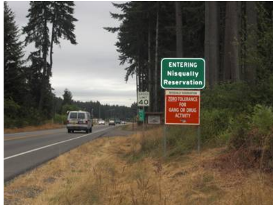
Photo: Nisqually Tribe sign shows zero tolerance for gangs and drug activity

The Northwest HIDTA will strengthen its cooperation with federal, state, county, local, and tribal law enforcement agencies as well as with the drug prevention and treatment community. The Northwest HIDTA will strive to offer innovative approaches in problem-solving and intelligence-sharing, in providing analytical support to gang investigations, and in preparing strategic intelligence products.