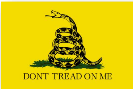
(U) Gadsden flag, commonly displayed by sovereign citizen extremists

(U//FOUO) Below are some visual indicators of these potential extremist and disaffected individuals: though some or parts of these symbols are representative of patriotic and American revolutionary themes; they are often associated with extremism: