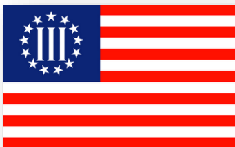
(U) III% symbol, synonymous with militia members present at the Malheur Wildlife Refuge occupation