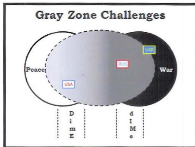
Figure 2: Participant perspectives of the Ukraine conflict

Finally, gray zone challenges feature ambiguity regarding the nature of the conflict, the parties involved or the relevant policy and legal frameworks. By definition, the gray zone is ambiguous, and this opacity results from both our own organizing principles and our adversaries' purposeful actions. We struggle when dealing with challenges not fitting neatly into our traditional models. No organization in the U.S. government has primacy for gray zone challenges, so it is unsurprising our responses lack both unity of effort and unity of command. Our adversaries are often well informed on our gray zone shortcomings, and they can act purposefully to maximize the ambiguity in a given situation. For example, Russian material and manpower assistance to separatists in the Ukraine is extensively documented, but official Russian government denials inject just enough uncertainty into the situation to blunt Western responses. The exact methods of obfuscation vary by situation, but even in the era of globalized information, adversaries can use ambiguity effectively to avoid accountability for their actions.