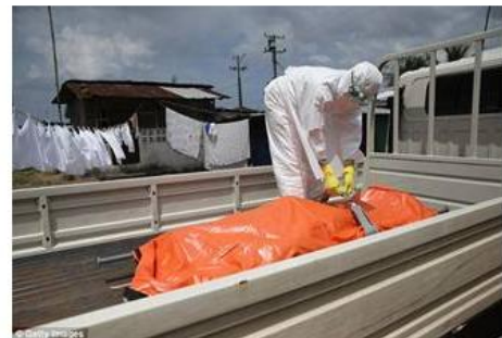
Body strapped into truck for transport