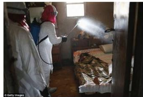
Burial team sprays a body for collection

(U) When burial management teams collect bodies from ETUs, this often means families cannot say their goodbyes or properly honor their dead or in some cases even see the dead body, except in a body bag, which is not common to traditional burial practices in these communities. 2 This has led to rumors of harvesting body parts and healthcare workers bringing the disease to communities, which have generated fear and suspicion in some populations, and even led to localized attacks on a few health clinics over the past several months.