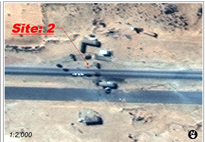
WorldView-02 satellite image recorded 05 March 2011