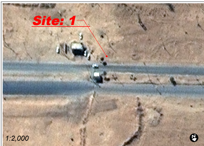
WorldView-02 satellite image recorded 03 March 2011