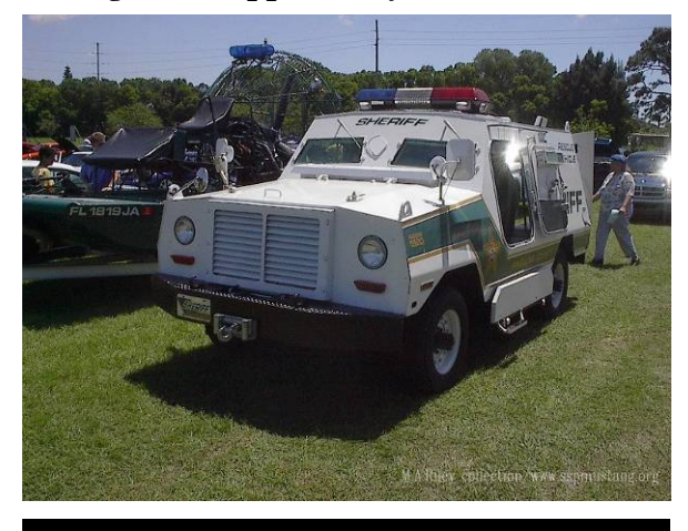
Peacekeeper vehicle owned by Pinellas County Sheriff's Office in Florida

Seizing on the opportunity, some vendors now market free grant assistance to law enforcement