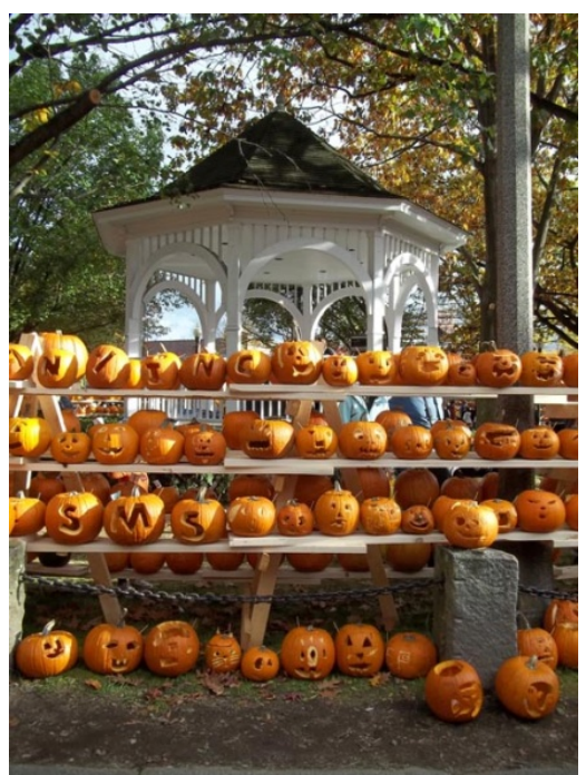
Keene Pumpkin Festival, potential terrorist threat?

The grant application for the BearCat cited the 2004 Pumpkin Festival and the 2007 Red Sox Riots, when the Red Sox won the World Series as examples of incidents when the BearCat could be used.<sup>197</sup> The Pumpkin Festival is an annual event with 70,000 visitors, many who come to Keene in hopes of breaking the world record of lighting the most Jack'o'Lanterns. The current world record holder is Boston with 30,128 lit pumpkins.<sup>198</sup> Local law enforcement considers the festival a possible