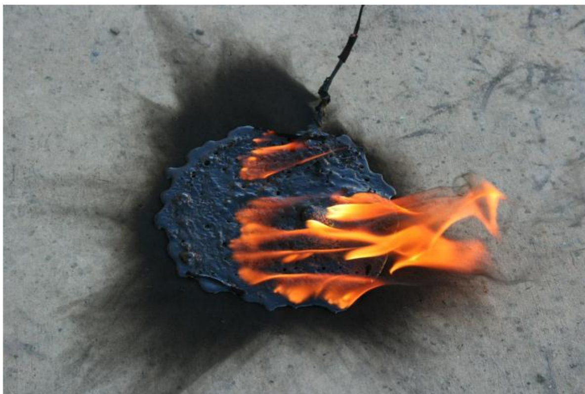
(U//FOUO) Figure 5. The device burned into an obsidian-like residue approximately 8-inches in diameter.