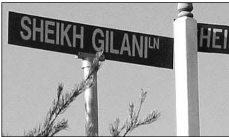
Street sign near Red House, VA commune

For example, in November 2003, two suspected