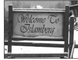
Sign posted in front of Hancock, NY commune