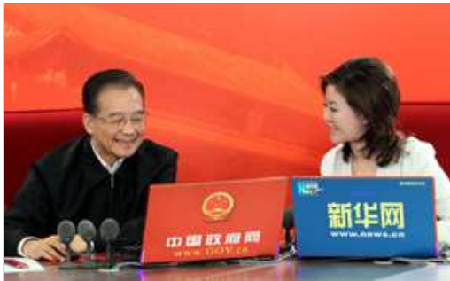
Wen Jiabao's 27 February web chat

Authoritative PRC media reports of Chinese Premier Wen Jiabao's live online appearances illustrate authorities' expanding use of the Internet to set and control policy discourse in Chinese-language virtual space. They also suggest ongoing efforts to manage leaders' images and portray them as accessible and soliciting online public opinion. While some apparent missteps suggest a cautious, evolving approach to interactive Internet media in relation to top leaders, reported leadership statements indicate sustained attention to the goal of incorporating new technologies into the propaganda system.