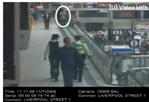
(U) CCTV footage catches police officers walking toward the subject.

On July 11, Subject 1 entered Liverpool Street Station, a major London transit and retail hub. Liverpool Street Station is the third busiest station in London after Waterloo and Victoria stations. During peak hours, approximately 26,000 people per hour move through the main concourse area and an additional 100 trains an hour travel through the underground station transporting another 30,000 people. At 11:15 a.m., police officers noticed Subject 1 walking along the upper concourse filming and capturing all areas of the station. His behavior was deemed suspicious by the officers because he appeared to be covering the red light on his cell phone with his finger indicating the phone was on video mode. The police stopped Subject 1 and asked to see the footage on his cell phone. An examination of the phone revealed 90 minutes of film footage, including a series of 25 minute videos of various train/railroad stations, security cameras, entrances/exits, bars, restaurants, and shopping centers. Subject 1 indicated he was a tourist and did not speak English. The police deemed both the video recording and Subject 1's interaction with them as suspicious. He was arrested under immigration offenses and transported to Bishops Gate police station. After further reviewing the film footage, authorities arrested Subject 1 under authority of the Terrorism Act of 2000.