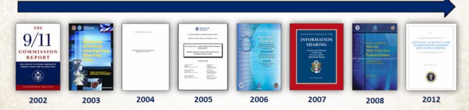
Figure 2: Foundation of Fusion Centers

To accurately define the National Network and articulate its role in national security, it is important to understand its evolution. The foundational elements of the National Network, notably that of information sharing, are first traced back to The 9/11 Commission Report , which proposed that "information be shared horizontally, across new networks that transcend individual agencies," and the 2003 National Criminal Intelligence Sharing Plan (NCISP). The NCISP serves as the blueprint to improve the sharing of information and criminal intelligence nationally. The focus on information sharing and incorporating state, local, and tribal entities was then further addressed in the 2004 Intelligence Reform and Terrorism Prevention Act (IRTPA). The IRTPA called for the creation of the Information Sharing Environment (ISE) and, for the purposes of the National Network, the specification that the ISE will provide and facilitate "the means for sharing terrorism information among all appropriate Federal, State, local, and tribal entities, and the private sector through the use of policy guidelines and technologies." <sup>13</sup>