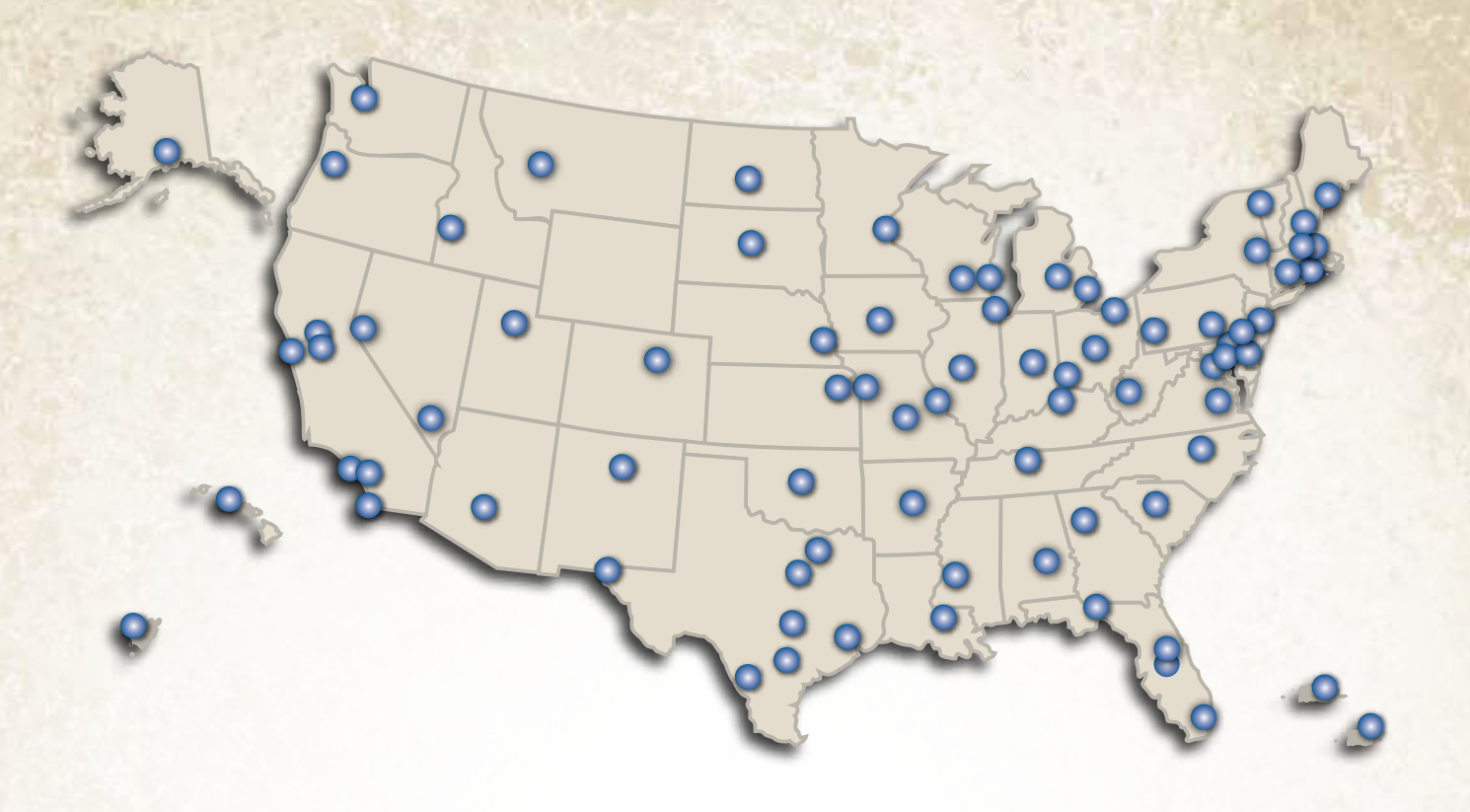
Figure 1: Map of the 78 state and major uban area fusion centers across the country (as of June 2014).

Network: A group of people or organizations that are closely connected and that work with each other.