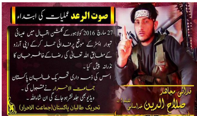
(U) JuA Claim of Responsibility for Attack (TWITTER)

NCTC Assessment: (U//FOUO) JuA's spokesman claimed the suicide bomber deliberately targeted the Christian community and threatened additional attacks. The nature of the soft target is consistent with TTP and its splinter groups' capability to target Pakistani Government and sectarian interests with minimal security, most notably the TTP attack on an army-run school in Peshawar in late 2014. (NCTC, REUTERS)