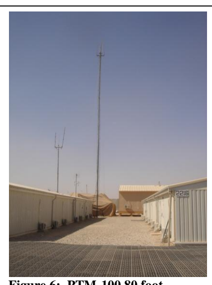
Figure 6: PTM-100 80 foot antennae significantly increased the range of RIAB transmissions.

• Basic Computer Network Operations Course (Army), Fort Belvoir, VA, a two week, "very technically oriented" course for those who will be involved with planning computer network operations at higher headquarters levels. <sup>114</sup>