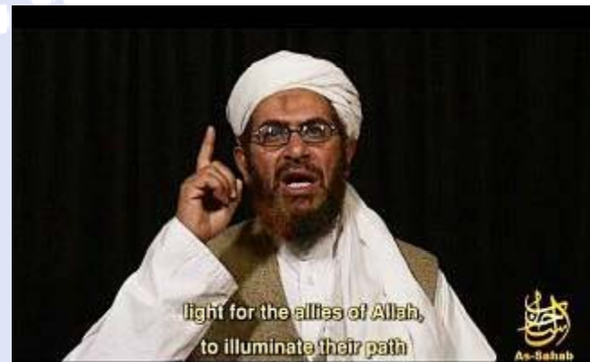
Mustafa Abu al-Yazid