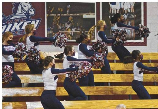
The USC Aiken men's and women's basketball teams took to the court Wednesday at the Convocation Center. Cheerleaders are pictured cheering on the Pacers. For game coverage, see page 1B.

USCA basketball teams get big wins Wednesday