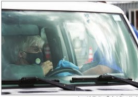
The covid-19 vaccine is administered Saturday at the Emory Health covid-19 vaccination testing site at Mohave Community College.