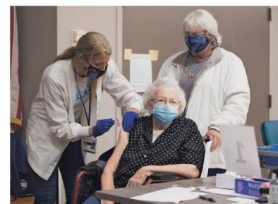
A woman receives a COVID-19 vaccine in New Hanover County as part of the Group 1B vaccination phase.