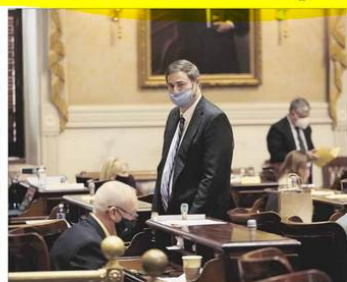
House Ways and Means Chairman Murrell Smith, center, walks through the chamber during the House session on Wednesday in Columbia. The House gave key approval to a plan to alter how COVID-19 vaccines are distributed in South Carolina.

COLUMBIA — South Carolina lawmakers are vying to override the Department of Health and Environmental Control's board on an allocation plan meant to equitably distribute the state's limited coronavirus vaccine supply. The House gave key approval Wednesday to the measure, part of a bill to direct up to $200 million in state surplus funds to bolster the state's vaccine rollout. The lawmakers' plan would direct the health department, DHEC, to allocate limited vaccine supplies across the state's four regions on a per capita basis, requiring it to take into account factors such as a region's rural and underserved areas, impoverished