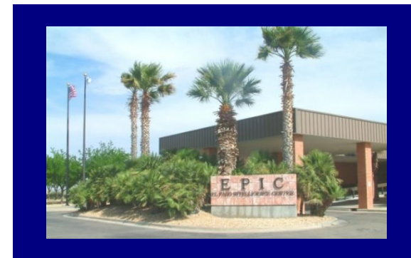
Enrique Camarena-Salazar Building