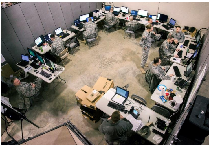
Members of the Ohio National Guard Computer Network Defense Team conduct cyber defense operations during exercise Cyber Shield 2015 at Camp Atterbury, IN.