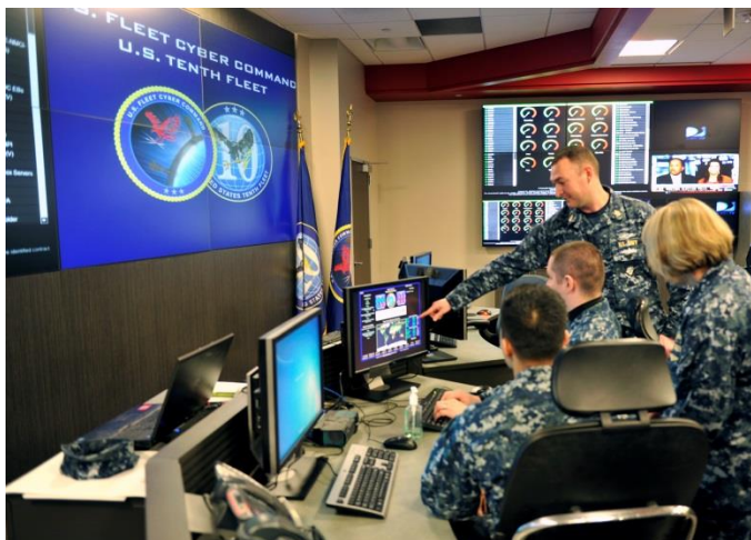
Sailors conduct an exercise at Fleet Cyber Command's headquarters in the Frank B. Rowlett Building, Fort George G. Meade, MD. This exercise features members of Fleet Cyber Command's Joint Force Headquarters-Cyber (JFHQ-C).

management; DoD must develop a new method for managing cross-program funding to improve mission effectiveness and achieve management efficiencies.