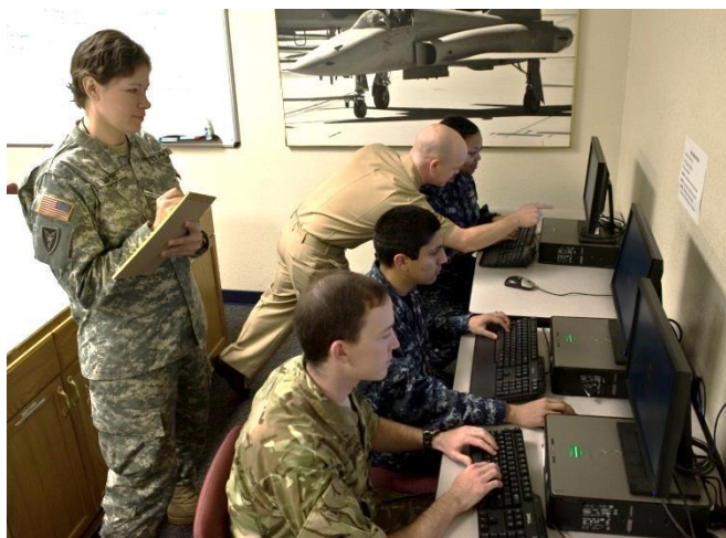
Cyber Flag 14-1 participants analyze an exercise scenario in the Red Flag building at Nellis Air Force Base, NV. Cyber Flag focuses on exercising USCYBERCOM's mission of operating and defending DoD networks across the full spectrum of operations against a realistic adversary in a virtual environment.

The Department of Defense must work with its interagency partners, the private sector, and allied and partner nations to deter and if necessary defeat a cyberattack of significant consequence on the U.S. homeland and U.S. interests. The Defense Department must develop its intelligence, warning, and operational capabilities to mitigate sophisticated, malicious cyberattacks before they can impact U.S. interests. Consistent with all applicable laws and policies, DoD requires granular, detailed, predictive, and actionable intelligence about global networks and systems, adversary capabilities, and malware brokers and markets. To defend the nation, DoD must build partnerships with other agencies of the government to prepare to conduct combined cyber operations to deter and if necessary defeat aggression in cyberspace. The Defense Department is focused on building the capabilities, processes, and plans necessary to succeed in this mission.