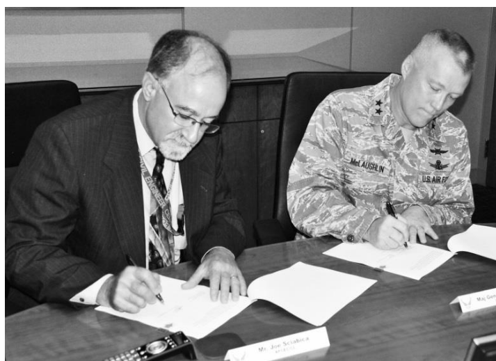
Mr. Joe Sciabica and Maj. Gen. J. Kevin McLaughlin sign an Air Force Civil Engineer Center-Air Forces Cyber collaboration agreement. The initiative is designed to enhance the security of industrial control systems that support critical Air Force infrastructures around the world.