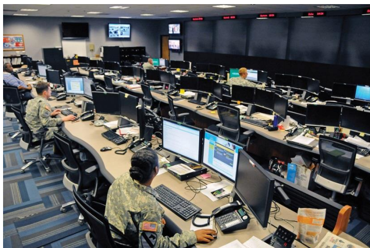
Soldiers monitor networks in the Cyber Mission Unit Operations Center at the Army's Cyber Center of Excellence, Fort Gordon, GA.