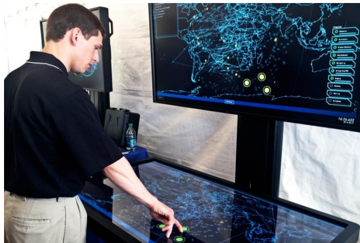
The Defense Advanced Research Projects Agency (DARPA) Plan X program is a foundational cyber warfare program that is developing platforms for the Defense Department. DARPA uses advanced touch-table displays to use finger gestures and motions to advance the state of the art in cyber operations.

DoD will have a framework in place to cooperate with other government agencies to conduct defend the nation operations. DoD will work with FBI, CIA, DHS and other agencies to build relationships and integrate capabilities to provide the President with the widest range of options available to respond to a cyberattack of significant consequence to the United States.