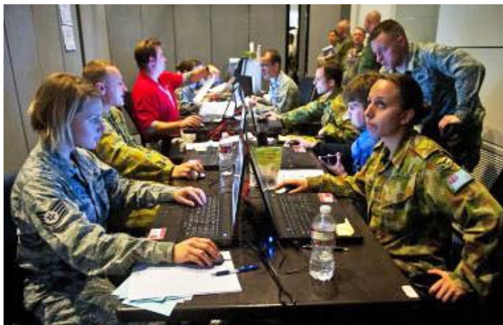
The Red Flag 14-1 Cyber Protection Team works on cyber defense procedures inside the Combined Air and Space Operations Center-Nellis, Nellis, NV. The CPT's primary goal is to find and thwart potential space, cyberspace and missile threats against U.S. and allied forces.

planned release of a satirical film, North Korea conducted a cyberattack against Sony Pictures Entertainment, rendering thousands of Sony computers inoperable and breaching Sony's confidential business information. In addition to the destructive nature of the attacks, North Korea stole digital copies of a number of unreleased movies, as well as thousands of documents