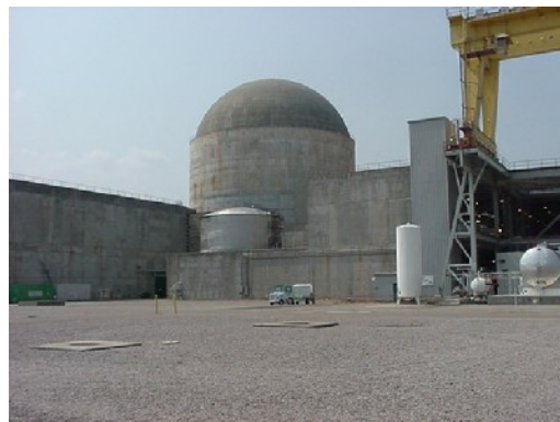
Figure 3 Nuclear Reactor Containment Building

The reactor vessel and the containment structure provide substantial barriers and defense-in-depth protection against the release of radioactive fission products to the environment. The reactor vessel is located inside the containment structure, which is designed to withstand earthquakes and tornados. The containment structure is also designed to minimize leakage of radioactive gases or fluids. At most PWRs and at some BWRs, the containment structure is a large, reinforced-concrete building with a steel liner (Figure 3). At most BWRs, the containment structure is a steel shell, surrounded by a reinforced-concrete building with a sheet metal top.