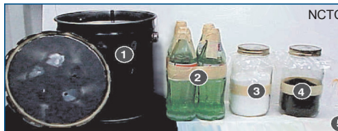
(U) Improvised chemical device.

(U//FOUO) An improvised chemical device, designed to release hydrogen cyanide gas by mixing several chemical components, could look like the device above, with all the components contained in a small vessel. This type of device would be most effective in a small enclosed space.