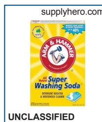
(U) Sodium carbonate.

(U//FOUO) Sodium cyanide can be produced using sodium carbonate (washing soda), charcoal, and ferric oxide.