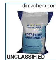
(U) Potassium carbonate.