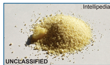
(U) Potassium ferrocyanide.

(U//FOUO) Potassium cyanide salt can be produced using potassium ferrocyanide and potassium carbonate.