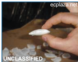
(U) Sodium cyanide briquette.