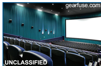
(U) Movie theater or auditorium.