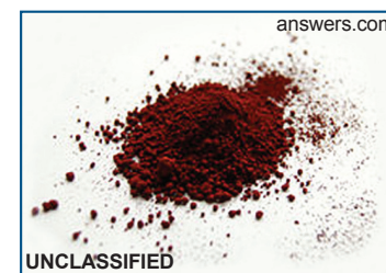
(U) Ferric oxide.