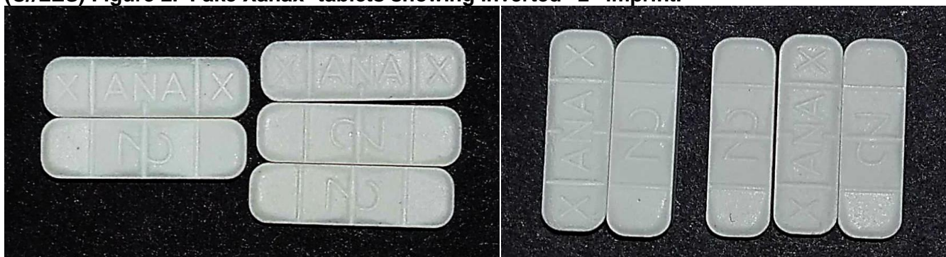
(U//LES) Figure 2. Fake Xanax® tablets showing inverted “2” imprint.

(U) Source: Arizona High Intensity Drug Trafficking Area