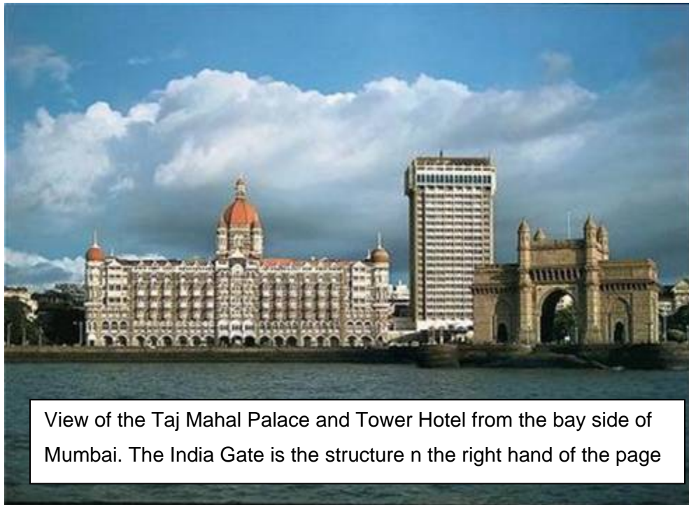
View of the Taj Mahal Palace and Tower Hotel from the bay side of Mumbai. The India Gate is the structure on the right hand of the page