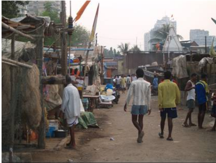
Neighborhood adjoining the Cuffe Parade Fishing Docks (NYPD Photo)