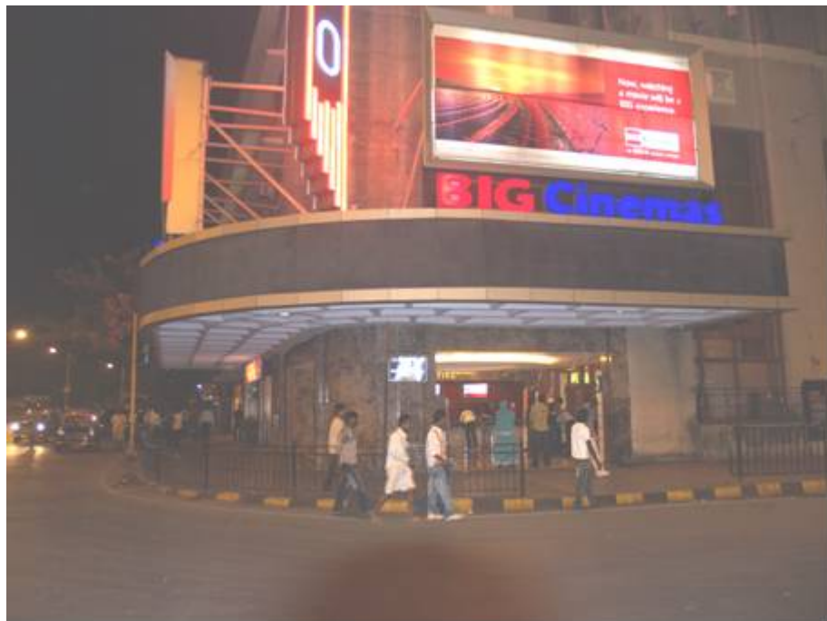
Metrobig Cinemas Movie Theater