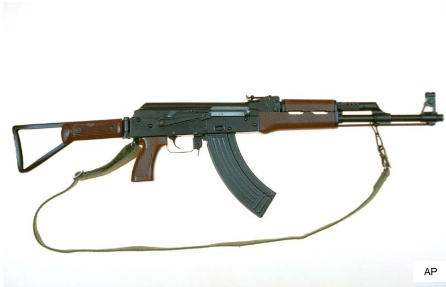
Chinese made AK 56 with folding stock