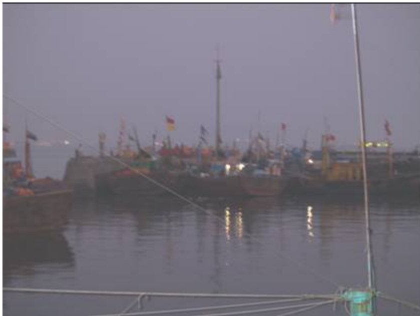
Apollo Bunder Fishing Docks