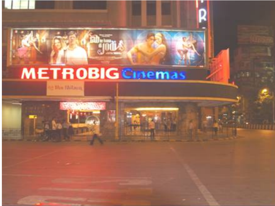
Metrobig Cinemas Movie Theater