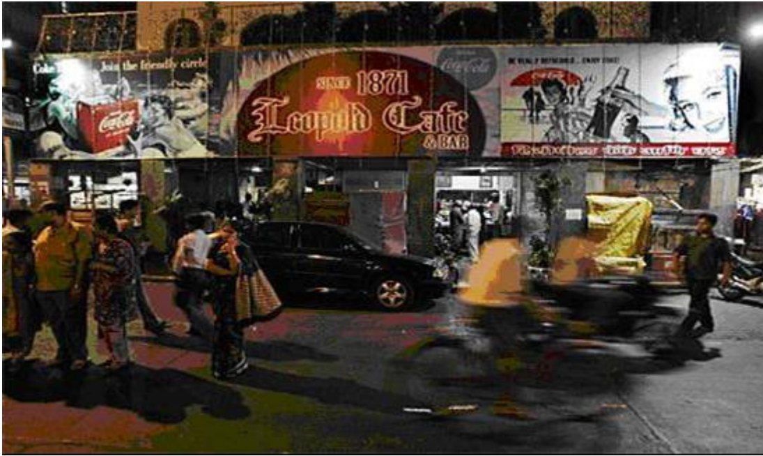
The Leopold Café as it appears in the evening.