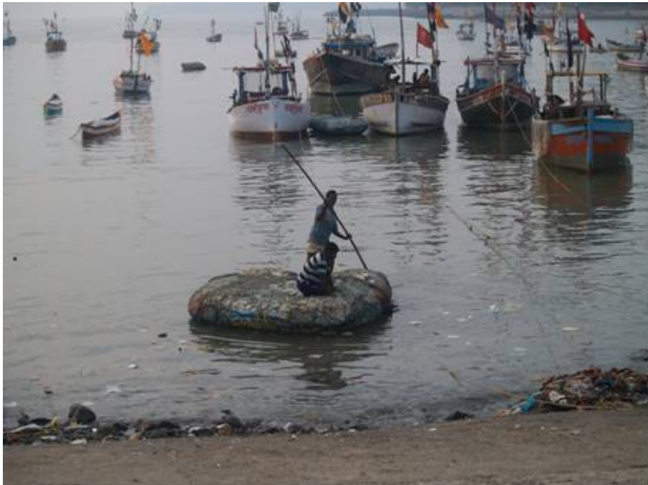
Cuffe Parade Fishing Docks