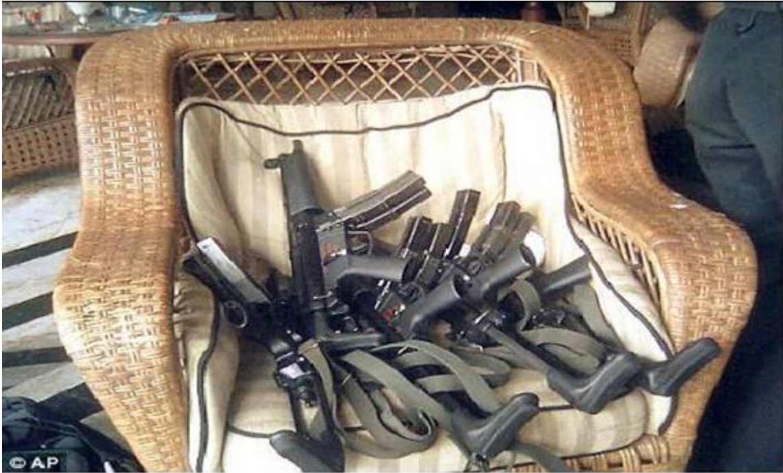
Captured H&K MP5