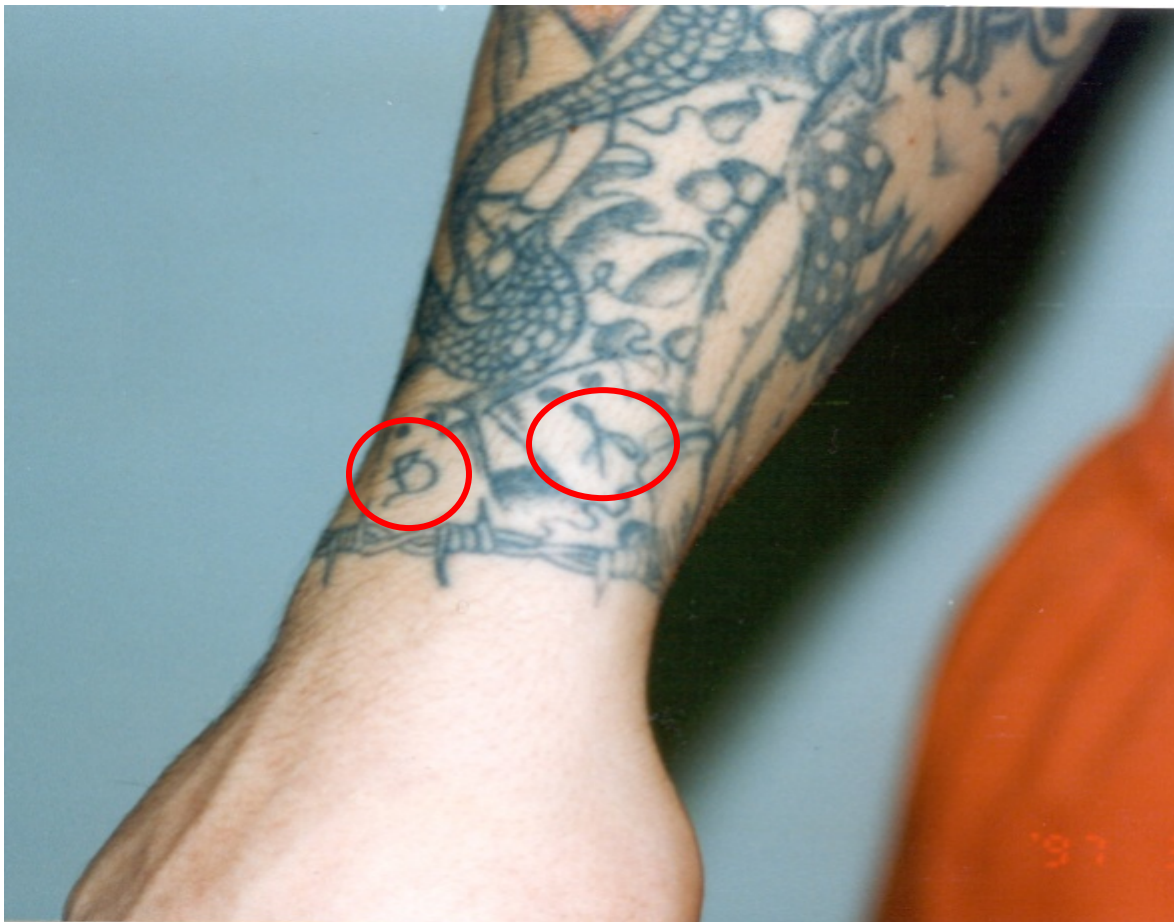
Graphic within tattoo may reference Barrio Azteca, 21, Azteca Indian Headdress, etc., or may just contain the word Azteca.