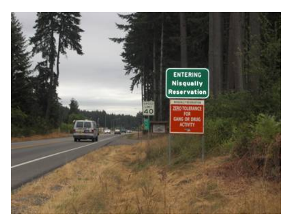
Photo: Nisqually Tribe sign shows zero tolerance for gangs and drug activity Source: Northwest HIDTA

The Northwest HIDTA will strengthen its cooperation with federal, state, county, local, and tribal law enforcement agencies as well as with the drug prevention and treatment community. The Northwest HIDTA will strive to offer innovative approaches in problem-solving and intelligence-sharing, in providing analytical support to gang investigations, and in preparing strategic intelligence products.