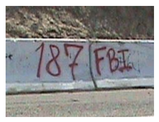
Photo: Graffiti at Colville Tribe. 187 denotes California Penal Code for murder

Gang-related crimes and violence increased significantly on the Colville Indian Reservation during 2009. Activity between the Barrios Los Padrinos (BLP) and the East Side Bloods (ESB), also known as Native Gangster Bloods (NGB), resulted in a shooting of a BLP member by an ESB member and a homicide of an ESB member by an unknown gang. In another gang related shooting in Omak, a rap artist from an Idaho Indian Reservation was shot by Surenos 13 (SUR 13) gang member from Douglas County. In Nespelem, Washington on the Colville Indian Reservation, an associate of the Native Gangster Bloods (NGB) and an NGB member shot at three vehicles over an earlier confrontation. Other gang related crimes include threats, intimidation, burglaries and drug dealing throughout the Colville Indian Reservation.<sup>18</sup>