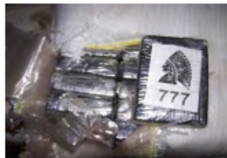
Indian Head and '777'