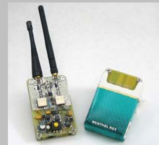
(U) Portable radio frequency jammer hidden in cigarette pack.

In October 2008, police in Canada encountered a vehicle driven by supporters of a violent motorcycle gang. The officers noticed that they were unable to transmit radio calls to other officers. During a search of the vehicle, they discovered a radio frequency jammer that blocked their radio transmissions within five meters of the device.