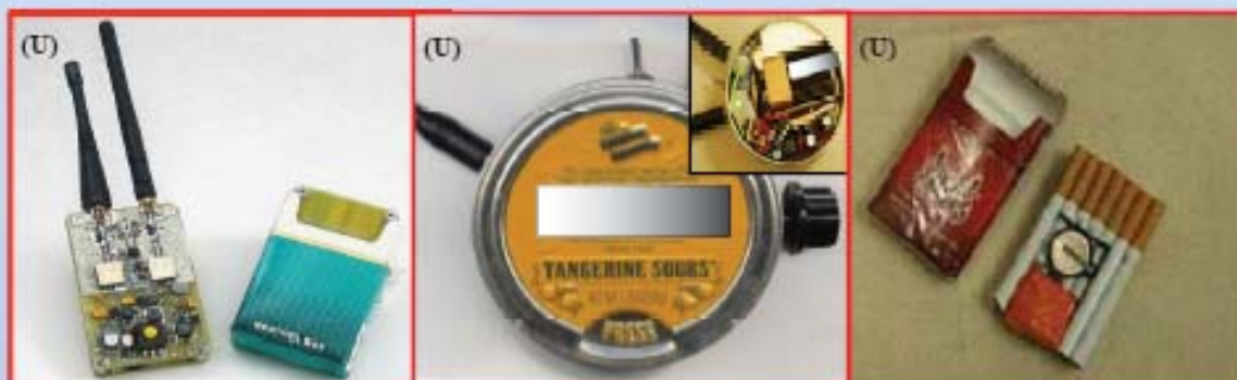
(U) Mock-up cigarette pack jammer