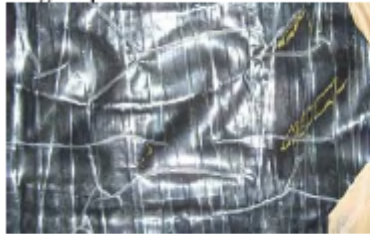
'222' ; impressed on cocaine bricks