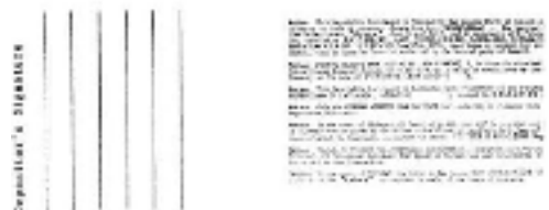
(U) Fraudulent Check Passed by Federal Inmate

Comment: The FBI assesses the inmates likely learned sovereign citizen fraud tactics while in prison; both were originally incarcerated for crimes unrelated to sovereign citizen extremism. Though this tactic was uncovered in the federal prison system, the FBI anticipates inmates will likely share the tactic and encourage its wider use.