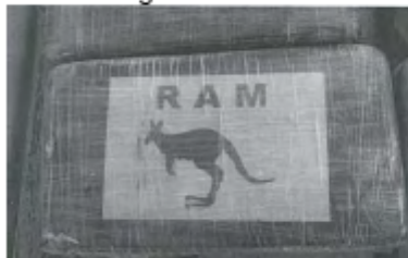
Kangaroo and 'R A M'