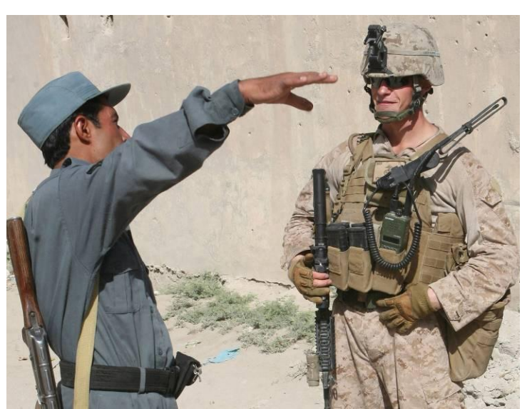
(U) Figure 2 Police Mentor Team

(U//FOUO) A primary goal of the training team is developing the ANSF. The primary issue for the battlespace owner is security. Good communication ensures that these are well coordinated. If they are not, either the teams may be overly exposed in a kinetic environment or the battalion may be performing functions that can be handed over to the developing host nation forces.