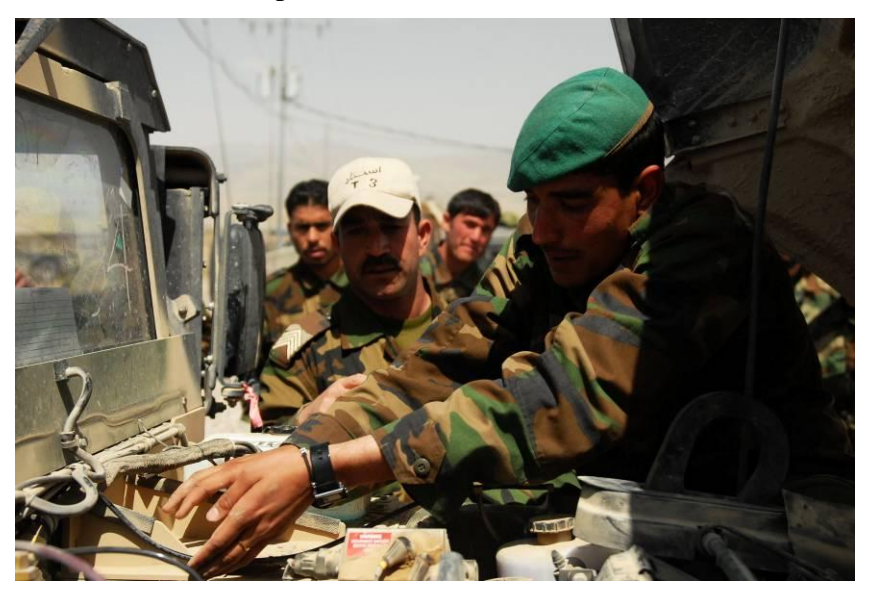
(U) Figure 6 HMMWV maintenance class

(U//FOUO) The ANSF's lack of equipment made it more difficult to partner. For example, one Afghan unit rated 65 HMMWVs but only had two that were operational. Lacking equipment such as metal detectors, fragmentation vests, and other personnel protective equipment, made it difficult for them to perform the same missions as the Marines.