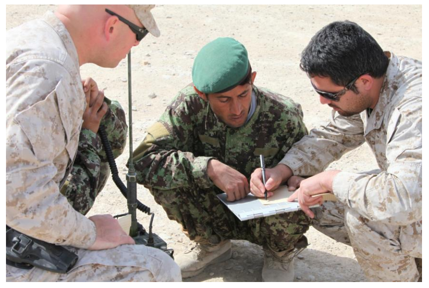
(U) Figure 4 Working with an interpreter

(U//FOUO) Many of the police forces, and other Afghan soldiers, were still at a very low skill level. Police officers, either military or civilian, were not required in most cases because the