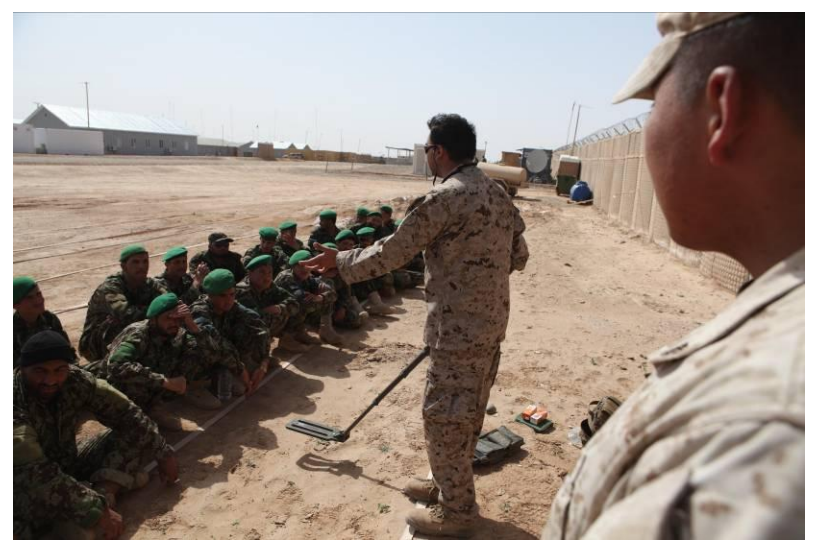
(U) Figure 7 Classroom Instruction

(U//FOUO) "If you go in there with the attitude that this is how we do it in the Marine Corps, or this is how coalition forces train or operate, without understanding Afghan culture and how they do business, then you're going to set yourself up for failure. ... Again, it may not be a solution that you would ever see that would be acceptable in the Marine Corps or another U.S. force or coalition force, but the bottom line is, if it's an Afghan solution and it works for them, and