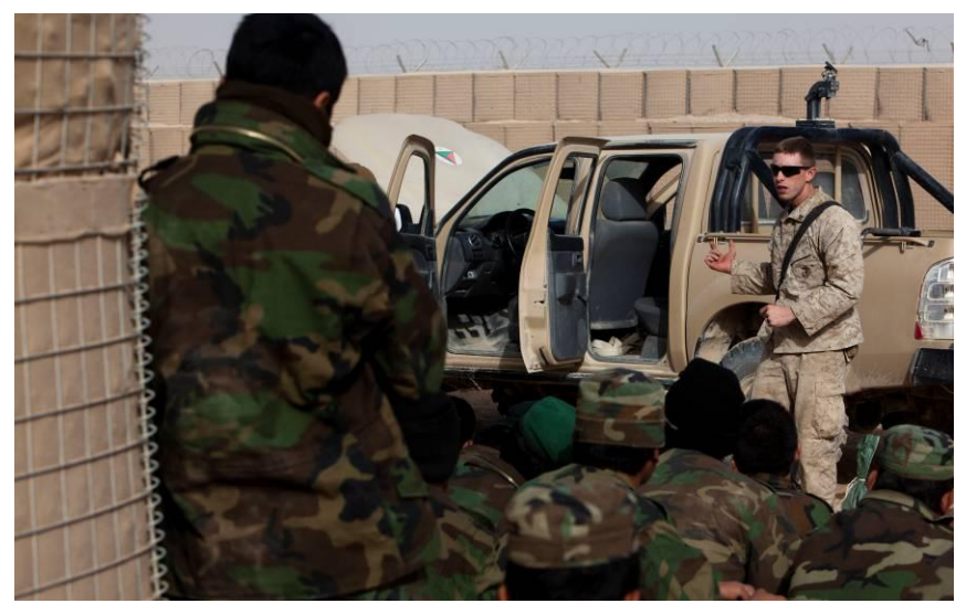
(U) Figure 3 Vehicle checkpoint class

depending on the security capacity of the ANSF unit. A newly formed ANA kandak's capabilities will be limited and require more partnering and mentoring. The responsibility for providing that resides with the partnered unit; the battalion commander partners with the kandak commander, staff with staff, and so on down to the fire team level. As the kandak's security capacity increases to a higher-level, partnership should give way to advising.