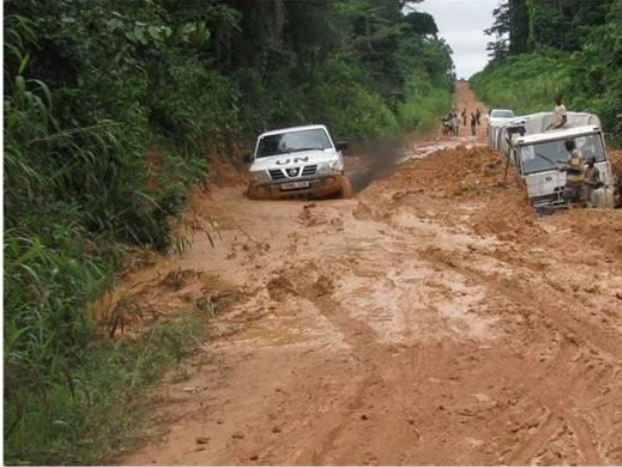
(U) Typical Roads During the Rainy Season

(U) Monrovia will continue to see persistent rain with embedded thunderstorms throughout the forecast period. These atmospheric conditions will make it very difficult for engineering and construction-based activities due to persistent and at times heavy rains. Furthermore, travel along all roads classified as “fair-weather” will be nearly impossible to traverse, due to the deterioration of ground conditions as 0.25 inches to 0.5 inches of rain is forecasted to occur on the 20 th . Roads classified as “all-weather” roads will be difficult to traverse during periods of heavy downpours. Forecasted thunderstorm activity