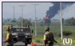
(U) Mexican troops increase security at key installations after pipeline explosion in Queretaro, Mexico, on 10 July 2007.

States from international terrorists, such as deploying troops to protect critical infrastructure and tightening immigration procedures. The Oil and Gas Journal estimated that, as of 2007, Mexico was the sixth-largest oil producer in the world and tenth largest in terms of net exports. 18,19