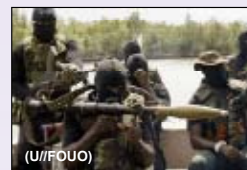
(U//FOUO) MEND - Nigeria's largest militant rebel group - is an active terrorist group dedicated to armed struggle against the alleged exploitation and oppression of the people of the Niger Delta and the alleged degradation of the natural environment by foreign multinational corporations involved in the extraction of oil in the Niger delta.

(U//FOUO) U.S. oil companies and facilities in the oil rich southwest of Nigeria's Niger Delta remain under constant threat of attack from Nigeria's militant rebels and criminal groups, in particular, the rebel group Movement for the Emancipation of the Niger Delta (MEND). MEND attacks on foreign-owned oil facilities, pipelines, and company employees have reduced Nigeria's oil production by approximately 23 percent. 21,22 Throughout the year, MEND has entered into several ceasefire agreements with the Nigerian government that specifically references the cessation of attacks against pipelines. Thus far, these agreements have only been temporary. MEND's goal is to repeal current laws governing the distribution of oil wealth generated by the Niger Delta region.