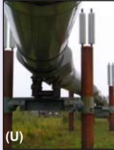
(U) Trans-Alaskan Pipeline

(U//FOUO) While attacks against pipelines and the oil and gas infrastructure are rare in the United States, they do occur with some frequency abroad. Islamic extremists clearly understand the economic significance of the gas and oil infrastructure, including pipelines, and see energy as a key center of gravity for Western nations. Intelligence reporting, public statements by terrorist leaders, and seized documents suggest terrorists have long seen the U.S. and global oil and gas industry as a high-value target and a prime means to disrupt U.S. and other Western economies.