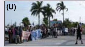
(U) 18 Feb: Earth First! blockade