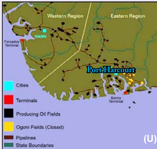
(U) Map of Niger Delta Region

(U//FOUO) More than 100 different Niger Delta militant groups thrive in this unstable area. The MEND, Niger Delta Peoples Volunteer Force, and the Niger Delta Vigilante Force are the predominant militant groups in the Niger Delta. However, militant groups in the region are deeply interlinked, making it difficult to establish the composition and structure of each group. Well-armed and organized groups attack foreign oil facilities, conduct criminal acts, intimidate security forces, and kidnap domestic and foreign oil workers. These activities are largely centered in, but not restricted to, the southern city of Port Harcourt and Niger Delta, which accounts for the majority of Nigeria's oil production activity.