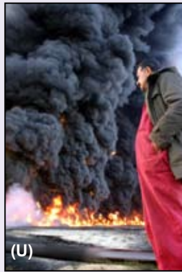
(U) Pipeline fire in Iraq.