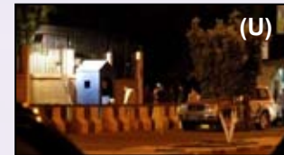
(U) April 2008: Al-Qa'ida attacks complex housing oil executives.