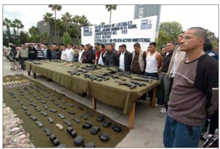
A 2009 cartel arrest in Tijuana, Mexico. The layout shows many of the weapons commonly used to conduct attacks against Mexican law enforcement.

During 2009, there were 43 (U//LES) documented cases of armed assaults against members of the Tijuana, Mexico enforcement resulting in homicide. Of the 43 cases, less than 12 percent have been resolved.<sup>5</sup> Tactics, techniques, and procedures used by the Tijuana Cartel and presented in this document are derived from open source reporting and Mexican law enforcement homicide cases from 2009. This bulletin attempts to identify commonalities across the large number of successful attacks determine some base-line tactics used by the Mexican cartels.