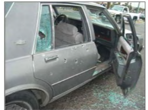
June 17, 2009 a Tijuana Municipal Police, Sub-Commander was killed in a vehicle ambush.

(U//LES//NOFORN) The majority of attacks against LEOs were vehicle borne attacks, either shooting from the vehicle or deploying from multiple vehicles. During 2009, cartels operated in convoys of two to five vehicles and targeted as many as six