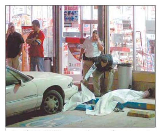
April 27, 2009 seven law enforcement officer in Tijuana, Mexico were killed in a single night.

(U//LES//NOFORN) The Tijuana law enforcement investigations and open source reporting identify three types of victims of a 'laying in wait' attack during 2009. The first are LEOs targeted based on regular patrol routes. The second are specific officers targeted for their involvement