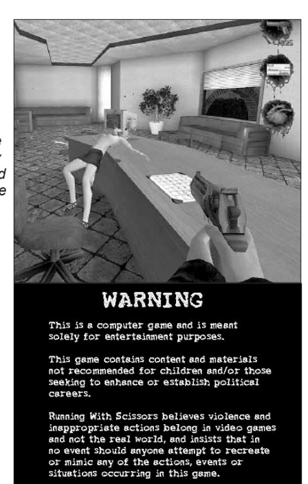
A screenshot from the FPS-style game "Postal 2" (arguably both inspired-by and inspiring-to rampage shooters) and the game's opening disclaimer

killing a total of 290 people and wounding 161. While it is possible to choose safer environments for work, i.e., white collar vs. third-shift retail, workplace shootings are very unpredictable. They are not confined to any particular industry, occupation, or income level.