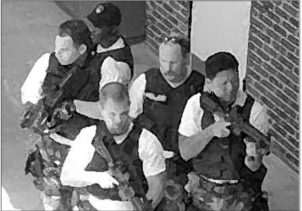
Response teams should be composed of no more than five officers, but not less than two