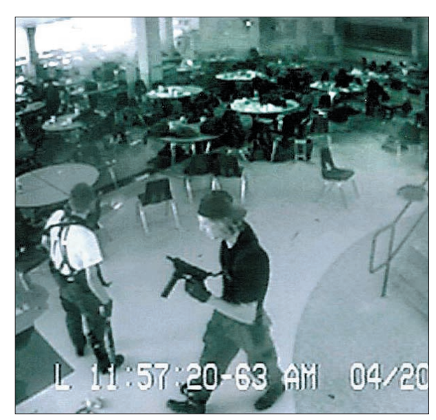
Harris and Klebold during shooting spree

enough explosive force to collapse the room, but fortunately failed to detonate.