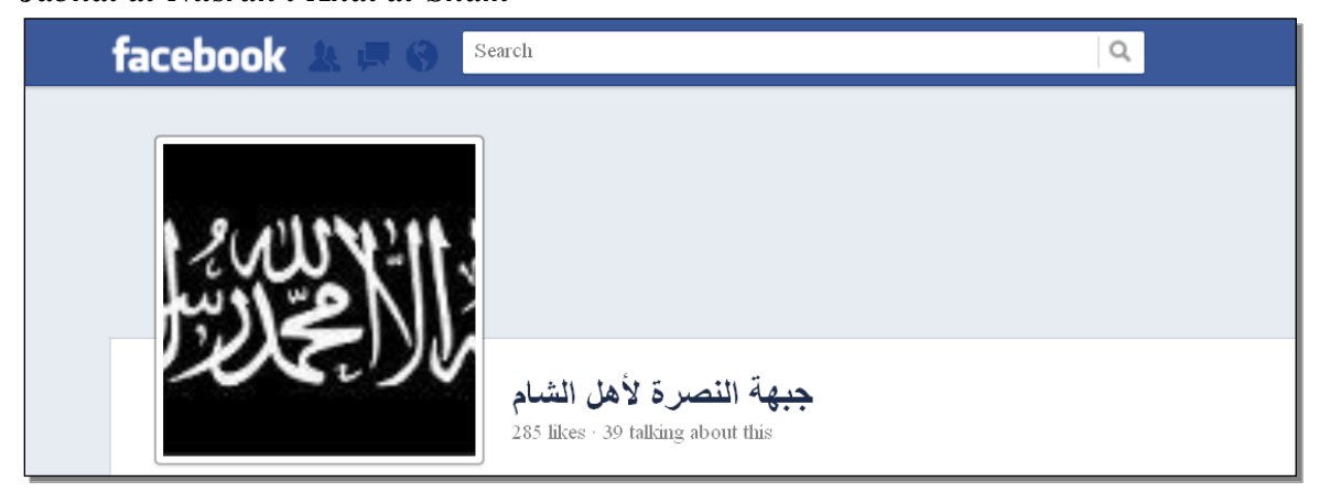
Jabhat al-Nusrah l-Ahal al-Sham

According to Facebook statistics, the page is most popular with 18-34 year olds and it is most commonly viewed from Tunis, Tunisia.