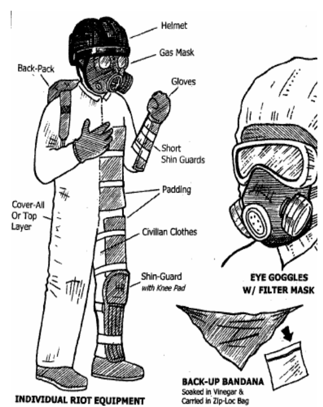
(U) Figure 3: The manual recommends an assortment of protective gear for rioters

(U//FOUO) All questions, concerns, and comments regarding this bulletin should be directed to the JRIC Situational Awareness Watch at (562) 345-1100 or <a href="mailto:jric@lajric.org">jric@lajric.org</a>