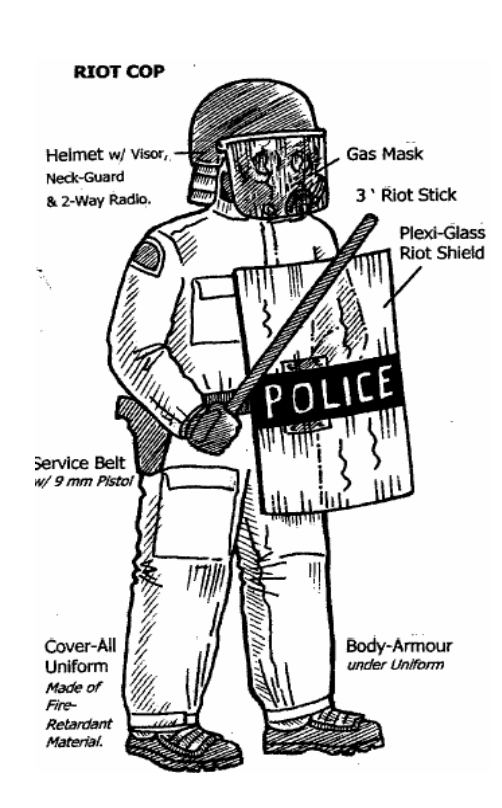
(U) Figure 1: The manual provides this view of typical law enforcement riot gear

(U//FOUO//LES) The purpose of this bulletin is officer awareness. Officers should know that instigators involved in violent demonstrations might be familiar with, and might try to apply, techniques from the "Crowd Control and Riot Manual." The handbook, from Warrior Publications teaches protestors how to defeat law enforcement crowd control techniques. Although it does not address specific groups or organizations, the information is widely applicable.