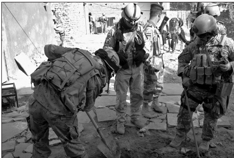
Figure 5. SOF with Iraqi counterparts search for evidence following explosion of an IED.

Television programs portray specialized forensic units indigenous to major LEAs that engage exclusively in collecting evidence and scientific sleuthing. Reality is a bit different. At all stages in their career, starting from the academy, officers learn how to isolate and protect evidence at a crime scene. Crime scene specialists then follow up, often under relatively controlled circumstances. Collection of evidence on the battlefield usually is more difficult. While specialists are available on some occasions, most often it will be SOF personnel engaged in the collection. For instance, teams have been sent in to attempt to confirm the identities of high-value targets who have been attacked and killed by bombs or rockets.