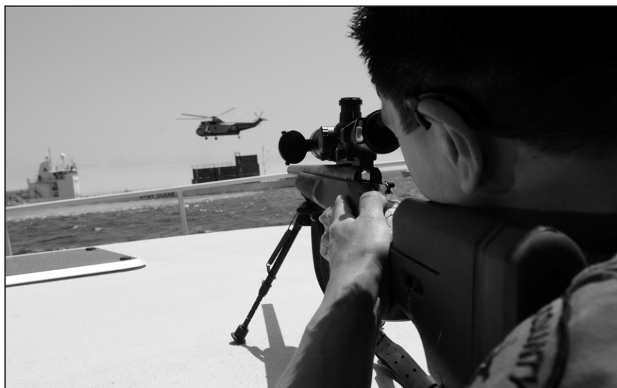
Figure 10. LASD sniper engaged in counterterrorism training exercise involving protection of shipping.

In many situations the sniper is employed to save lives. While that might sound counterintuitive, in both SOF and law enforcement, the sniper is often used to protect others. SWAT units resort to use of deadly force as a last resort. Unfortunately, movies and television have contributed quite negatively and produce an image of trigger-happy marksmen. The reality is far different; it is only in rare instances that SWAT snipers actually