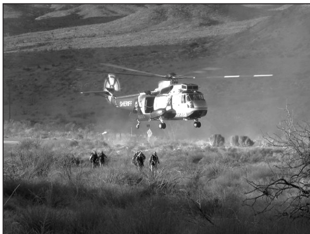
Figure 1. Los Angeles Sheriff's Department SWAT team members training for small-unit tactics in the Mojave Desert.

Local and international gangs have precipitated a level of violence in some precincts that is unparalleled in our nation’s history, even dating to the notorious crime syndicates of the early 20th century. The response by many LEAs has been to organize and train specialized units, commonly called SWAT teams, which often have capabilities to perform operations that bear striking resemblance to small unit military operations.