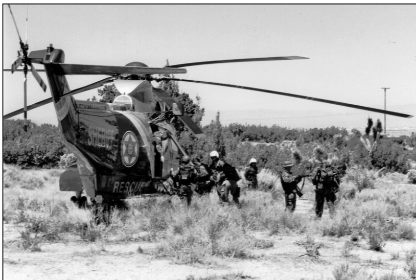
Figure 2. LASD SWAT team responds quickly to active shooter.

it is important to engage the shooter as rapidly as possible. As on combat missions, it may be necessary to bypass wounded victims in order to minimize casualties of innocent bystanders. This consideration represents a substantial change in thinking for law enforcement and is an example of the convergence of the operations. Because of the LEA experiences with multiple shooters and substantial numbers of casualties, the need for area security now preempts immediate care for victims.