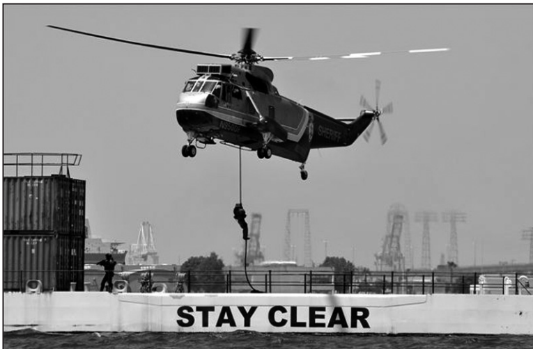
Figure 13. LASD SWAT team member executing a fast rope insertion onto a ship in a counterterrorism exercise.

Whether all areas of the country will have adequate response capability remains to be seen. Mentioned was the expense associated with developing and maintaining specialized units. National-level funding to accomplish that task could be provided, even though we are in a zero-sum environment when it comes to spending. While regional cooperation is improving, much more could be done. For local jurisdictions, having specialized units on a full-time basis is resource constrained based on the current tax situation. For departments in large metropolitan areas, maintaining SWAT teams is