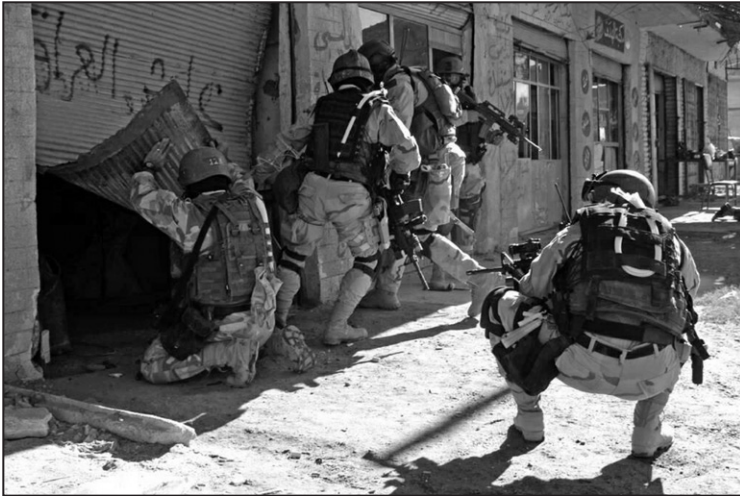
Figure 3. SOF conducts dynamic entry in search of high-value target in Iraq.

apparent, but in ways unanticipated. It was the SOF involvement in the legal aspects of mission execution followed by criminal prosecution that was totally unexpected. In most incidents, they were serving as advisors to Iraqi officials who were technically in command of the operations. Still, the SOF personnel found themselves integrally involved in the Iraqi legal system.