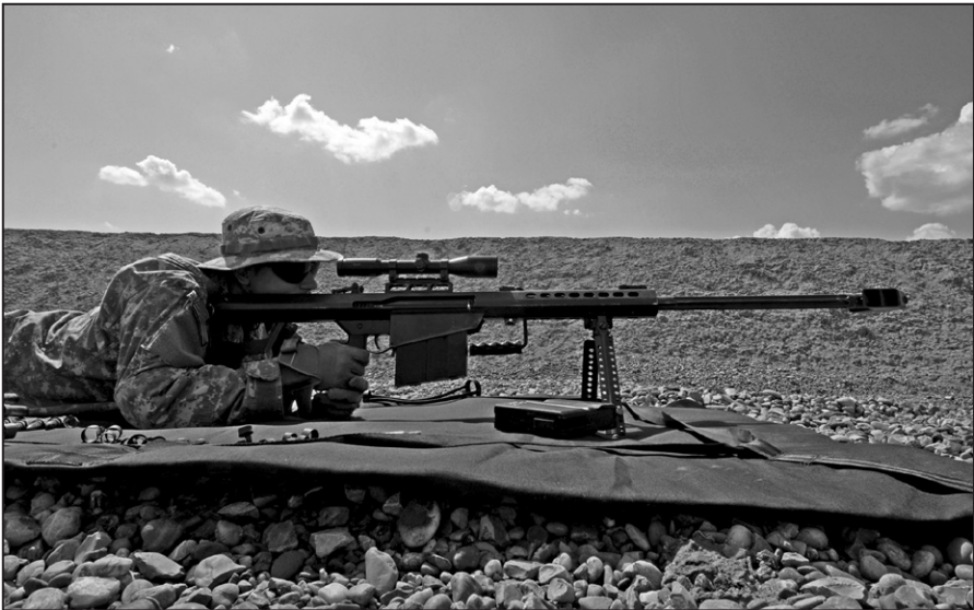
Figure 9. SOF sniper training in desert environment.

One aid in dealing with cross-jurisdictional manhunts is that sheriff's deputies also can be sworn as U.S. Marshals. This capability may allow the suspect to be arrested by officials from the original jurisdiction of the crime and expedite extradition. International cases are considerably more difficult. Even if the suspect's whereabouts is known, the time and expense required for international extradition makes such processes reserved for only the most egregious crimes. 153