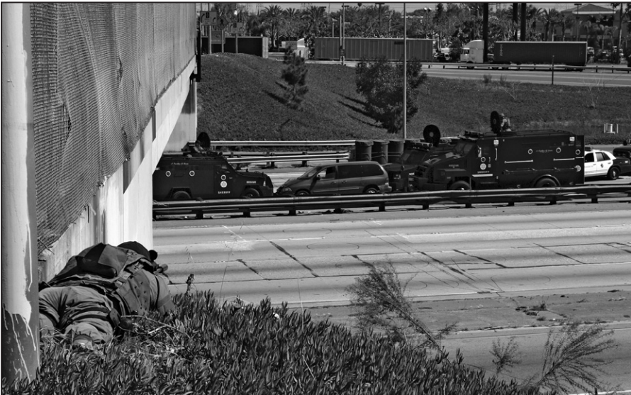
Figure 7. SWAT sniper in overwatch as team members take down a suspect in a vehicle on a Los Angeles freeway.

Given their career in an LEA, they get to know individuals and develop networks that can support their activities. Most major metropolitan areas employ the program known as COPS. Those Community-Oriented Policing programs assure that officers are assigned to a specific small geographic area. It is designed to have officers know the community leaders and businessmen. Ideally, they actively participate in local activities, work to gain the trust of the population, and listen to their problems and concerns. 131 It was found that fixing small problems and grievances greatly reduced larger ones. Again, the LEAs have the home court advantage.