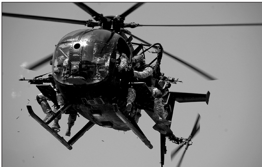
Figure 12. SOF engaged in counterterrorism operation approaching the target.

Threats posed by international terrorists are of major concern to national LEAs that function primarily under the jurisdiction of the Department of Justice. Recognizing that they constitute only about 5 percent of the law enforcement personnel in the U.S., they are now engaging with state and local officials as never before. Area fusion centers have sprung up across the country, and information sharing is improving—but has a long way to go. As noted in The 9/11 Commission Report , interagency cooperation was severely lacking prior to that attack. Constant attention and improvement is