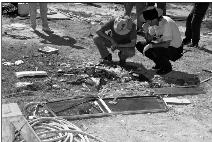
Figure 6. Crime scene investigators search for evidence in a bombing that killed a federal witness in Las Vegas.

When IEDs are encountered, even after boom , minute details remain and individuals have been identified from the scraps of evidence collected. Thousands of latent fingerprints have been taken off of bomb components such as circuit boards, batteries, and remote control devices. 85 Much of the forensic investigation is conducted by FBI scientists with whom many USSOCOM units have been collaborating for the past few years. 86 What seems certain is that SOF personnel will continue to be involved in obtaining and protecting vital evidence. Defensive issues are also to be addressed so that forensic science does not threaten the identity of SOF operators. Both sides of this coin lead to the conclusion that more intensive training is dictated.