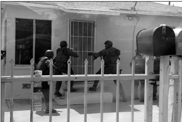
Figure 4. LASD SWAT practicing dynamic entry for service of high-risk warrants.