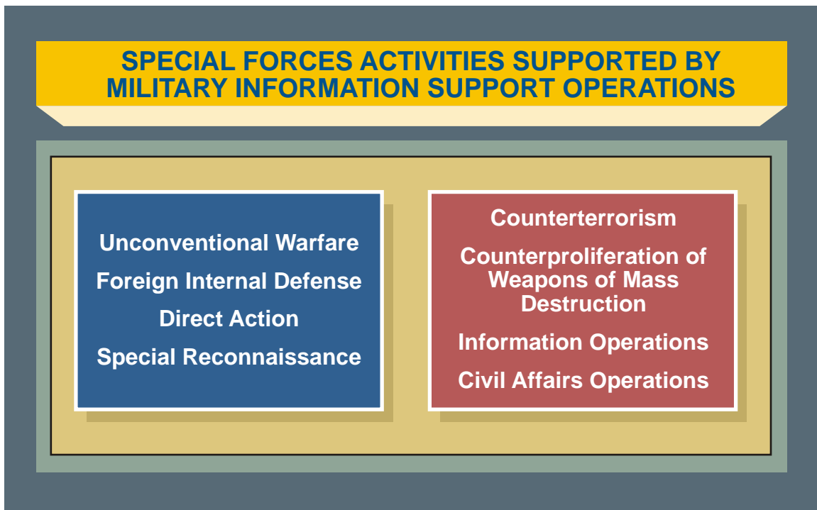
Figure VI-1. Special Forces Activities Supported by Military Information Support Operations

(1) Direct Action (DA). DA are short-duration strikes and other small-scale offensive actions conducted as a special operation in hostile, denied, or politically sensitive environments and which employ specialized military capabilities to seize, destroy, capture, exploit, recover, or damage designated targets. MISO can be integrated in all DA activities,