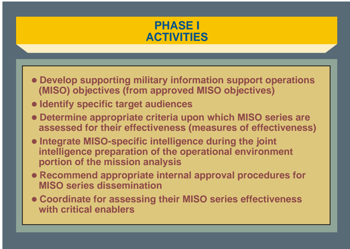
Figure V-2. Phase I Activities