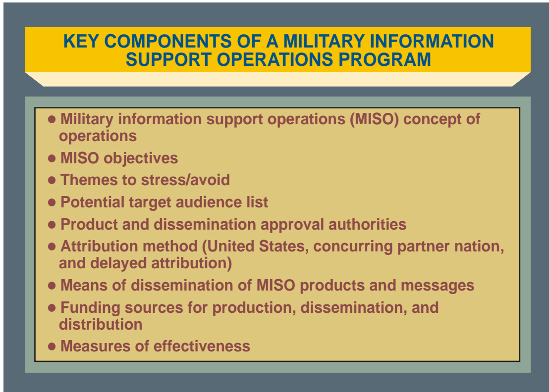
Figure V-1. Key Components of a Military Information Support Operations Program