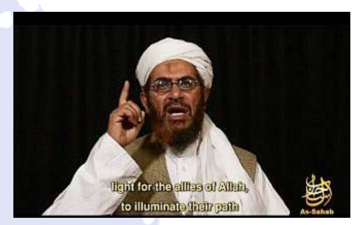
Mustafa Abu al-Yazid