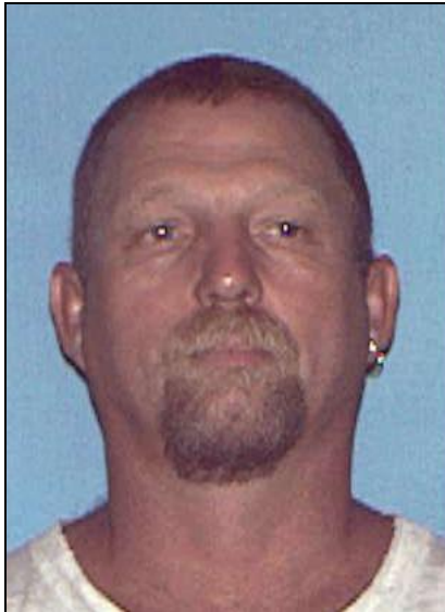
(U) Department of Revenue Photo Dated Approximately 2008