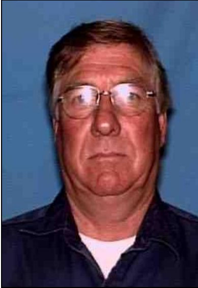
(U) Department of Revenue Photo Dated Approximatley 2010