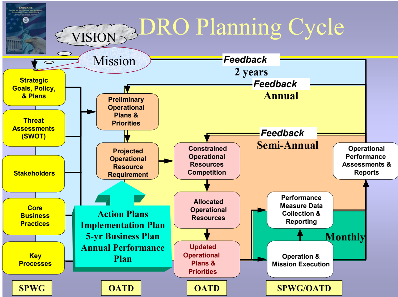
Figure 4. DRO Planning Cycle