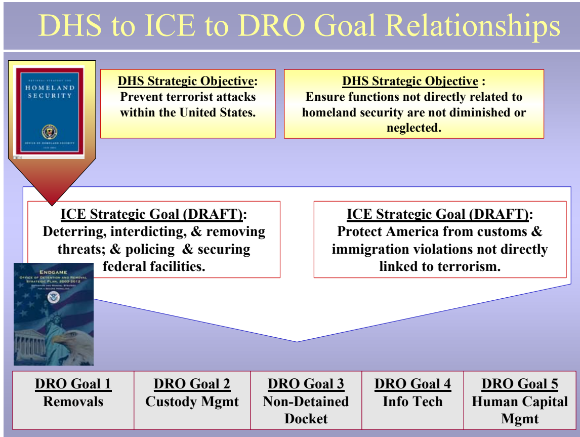
Figure 1. Relationship between DRO, ICE and DHS Strategic Goals and Objectives

When implemented to its fullest, this plan will serve as the platform from which strategies will be initiated, partnerships will be built, and innovation for continued process improvement will be fostered. This vision will be realized, and the mission will be accomplished, only through the collective and collaborative efforts of all DRO employees. DRO employees (including officers, management, and staff) must encourage growth and improvement through the sharing of ideas and the integration of DRO core business functions with key processes, all critical elements of the immigration enforcement program.