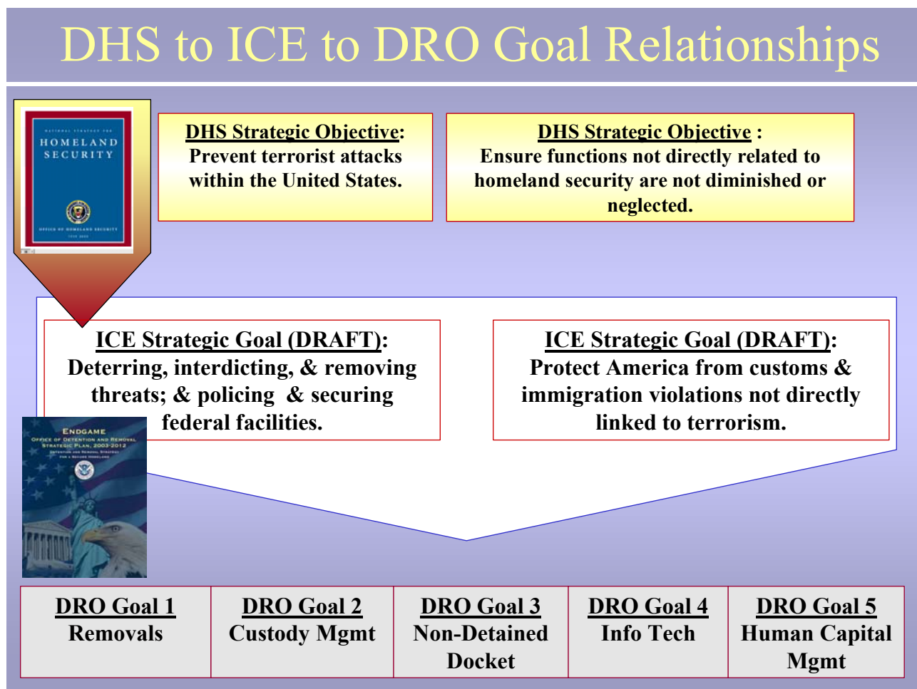
Figure 3. Relationship between the Department of Homeland Security, Immigration and Customs Enforcement, and Detention and Removal Operations

is, DRO is responsible for the detention, processing and removal of aliens apprehended by other immigration and law enforcement partners. DRO does not, however, have control over these enforcement efforts and must rely on its partners to provide estimated service and support needs and resource requirements.