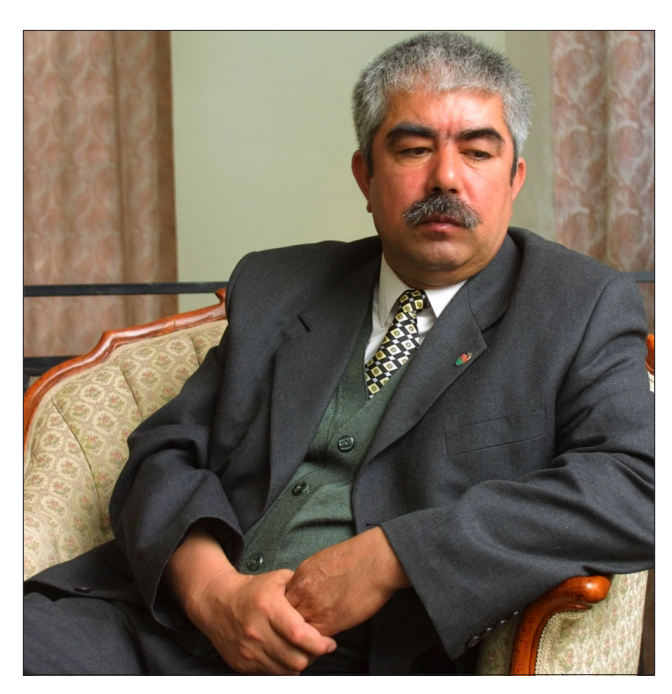
General Abdul Rashid Dostum

(SBU) The terrorist use of disguises can also be an effective tool to collect intelligence for target planning. Disguises enable the surveillant to blend into their surroundings without arousing suspicion -- a critical factor during the preoperational surveillance phase. It is at this stage that the terrorist is most vulnerable by exposing himself to the target prior to the attack. Posing as a beggar offers the surveillant a number of advantages that other ruses do not. Firstly, begging is universal and their behavior normally does not raise a red flag. In fact, people go out of their way to avoid them. Even law enforcement personnel view beggars as a nuisance, and do not perceive them as a threat. By making them "invisible" the "beggar" can case a target without being scrutinized. It also makes it more difficult to identify and/or describe them later on. Secondly, the nature of begging provides the surveillant with the flexibility to conduct both mobile and static surveillance. Thirdly, most beggars are prevalent in urban areas -- as are our diplomatic facilities.