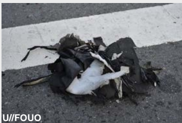
U//FOUO (U//FOUO) Remains of backpack.