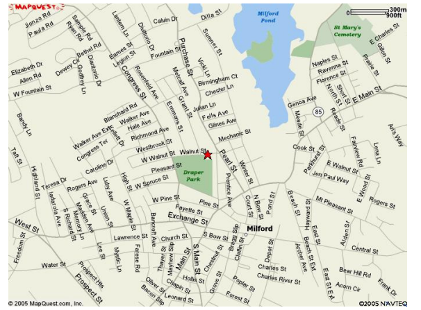
Memorial Elementary School, Milford, MA