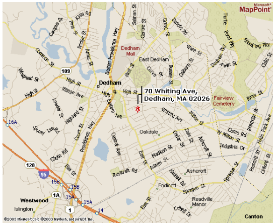
Dedham Middle School, Dedham, MA

(U/FOUO) Last night the FBI issued the following warning: