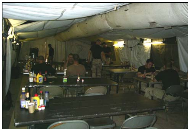
Camp Griffin Chow Tent – UGRs served daily