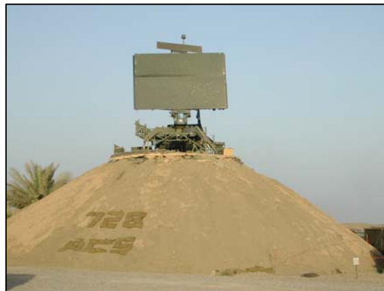
Radar “A” set up on abandoned Iraqi SA-9 mound.