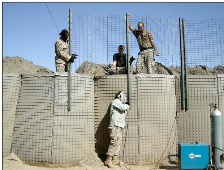
For maximum protection along Camp Griffin's north perimeter, the DEMONS erected a 375 foot long, homemade, experimental, anti-RPG fence on top of the Hesco barrier wall.