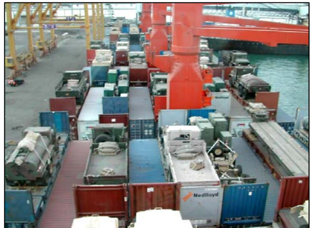
DEMON equipment on deck of the M/V Nordwelle.

The ACS leadership had numerous discussions with Military Traffic Management Command (MTMC), the U.S. Army’s command which serves as DOD’s single port manager worldwide. At the Port of Shuaiba they were responsible for contracting, customs clearance, documentation, cargo stow planning, and vessel loading and discharging.