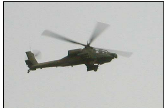
Apache flies low overhead Camp Griffin enroute to support ground troops in contact.

Operation is designed to stop the amount of improvised explosive devices being emplaced around the Fallujah area.