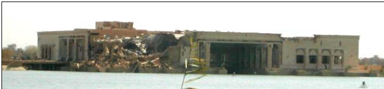
Abu Ghuraib Presidential Site (Ba'ath Party Headquarters) near airport was heavily damaged during air attacks.

First Sergeant set up a tour for troops to get out and visit the local palaces on their day off. The tour would visit the Radwaniyah and Abu Ghuraib Presidential Sites to tour the Victory Palace, Ba'ath Party Headquarters, and Children's playground. The tour would end at the Army PX, and for lunch a choice of the U.S. Army's Bob Hope DFAC (Dining Facility) or Burger King. Each tour usually lasted about 5 hours. Over 70 DEMONS took advantage and went on the tour.