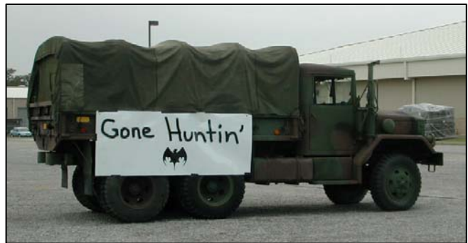
Only deuce left behind at Eglin, Unit...Gone Huntin’

The military charter aircraft landed at Kuwait International Airport and the troops processed at the Army’s in processing center at the airport – Camp Wolf. The 196 troops and nearly 800 bags were loaded onto buses and semi tractor trailers and driven to Ali Al Salem. The ADVON team, assisted by members of the 729 th ACS already had billeting arrangements at Salem tent city.