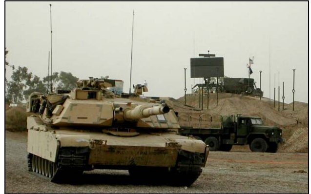
An unusual event, tank meets radar. U.S. Army neighbors brought an Abrams tank and a Bradley Fighting vehicle over to Camp Griffin for an exchange.