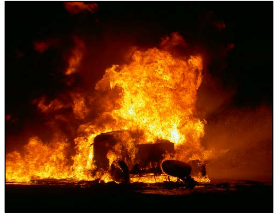
Iraqi 60mm mortar direct hit on fuel pod.