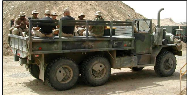
“Convertible” hauling DEMONS on Camp Griffin.

The second ADVON team of 12 arrived via C-130 to bring additional manpower and supplies to prepare the site. The team brought a “convertible” M-35, 2 1/2 ton truck, a Darnell tent, C-wire, fuel for the Gator and additional cases of MREs. The reason the M-35 was a “convertible” was due to height restrictions, in order to get the truck loaded on the aircraft the roof of the cab had to be removed. The convertible deuce was very distinctive on BIAP.