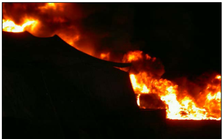
Enemy mortar attack. Fire raging behind Camp Griffin's living tents fueled by 900 gallons of diesel fuel from ruptured tanks.

Camp Griffin went into alarm red immediately following the first explosions. Camp Sather also went into alarm red. The Baghdad Airport Fire Dept was within a mile of Camp Griffin extinguishing a trash fire at the Army's LRP when they saw the fireball. They responded and were on Camp Griffin within 2 minutes of the attack. They foamed the fire and had it extinguished within a few minutes. 100 percent accountability of DEMONS at both Camp Griffin and Camp Sather was difficult but completed within 30 minutes. New accountability procedures were developed and put into place.