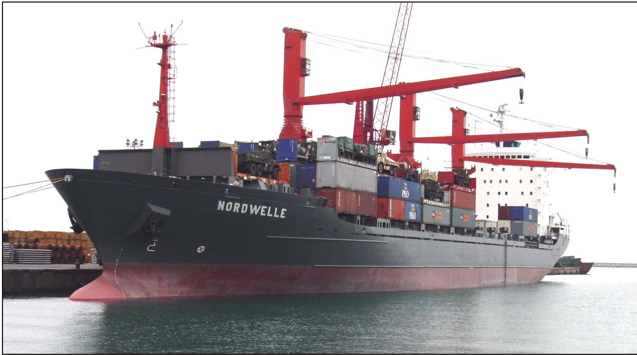
Heavily laden with DEMON equipment, M/V Nordwelle ready to set sail from Port of Salerno, Italy to Kuwait.

Team of 7 DEMONS lead by the Chief of Maintenance flew to Salerno, Italy to oversee the transloading operation of the equipment from the two ships onto one ship. They also sailed onboard to escort the equipment from Italy to the final port in Kuwait for offloading.