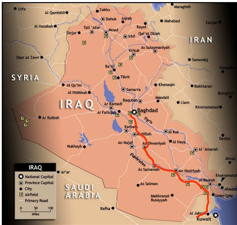
Map depicting the 480-mile convoy route from Kuwait to Baghdad.

Al Daghgharah Baghdad International Airport (access road through airport wall)