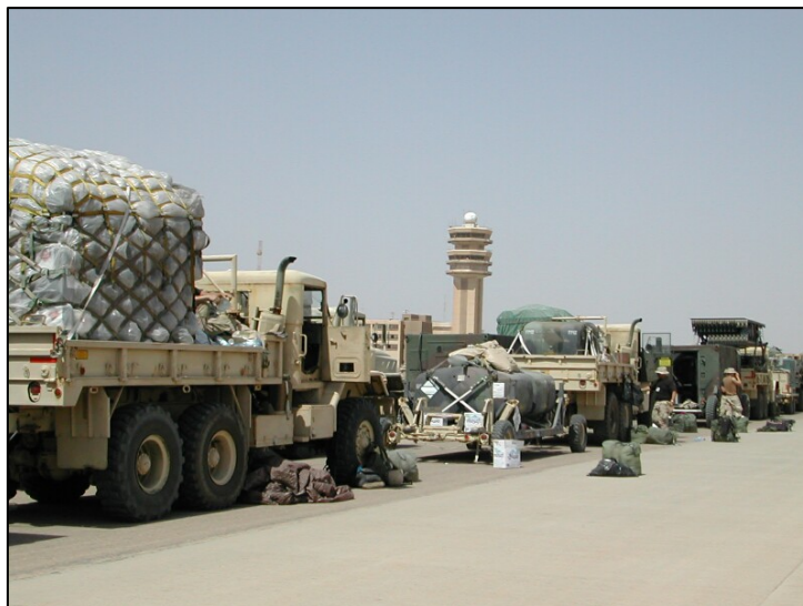
DEMON vehicles staged on the ramp near the control tower.