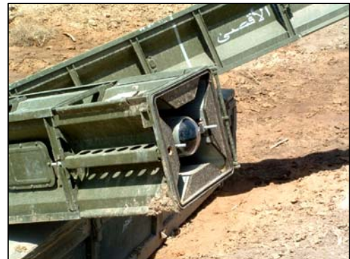
Cases of live SA-9 missile littered the site.

The group continued to prepare the site using graders, and taking deliver of sand and gravel. They also conducted a visual UXO (unexploded ordinance) sweep of another part of the site and cleared 37 live SA-9 missiles, 40 M-77 anti-armor sub munitions, and numerous cases of AK-47 ammunition. Much of the acreage designated for the CRC was covered in M-77 anti-armor sub munitions left over from the battle to capture the airport just days prior. The U.S. sub munitions were launched from the MLRS (Multiple Launch Rocket System), empty launch tubes and rocket casings were laying around on site.