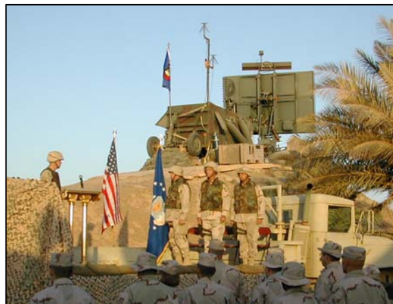
728 ACS change of command, 27 Aug 2003. Lt Col Randy "Pup" Nelson relinquished command to Lt Col Scot "Nazi" Shively.

The ceremony was held in the bed of a 5-ton truck (a CRC first?) and was the unit's first combat change of command. DEMON Services troops catered a reception that was held in the vehicle maintenance shelter following the ceremony.