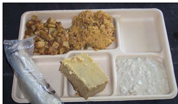
Hot breakfast – UGR style, served at Camp Griffin.

A field recreation system was established on Camp Griffin, 15 fitness and condition programs were written for personnel deployed to BIAP, an outdoor weight room was constructed. Cardiovascular training equipment was procured for site personnel. An outdoor theater was constructed showing one feature film per week. Services personnel also made weekly ration runs and provided security for Camp Griffin.