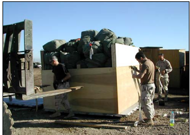
Packing luggage pallets for C-130 flight to Kuwait City.

Of the 4 C-130s shuttling DEMONS to Kuwait City and Al Udeid, 3 were shot at by small arms fire while climbing out of Baghdad International Airport.