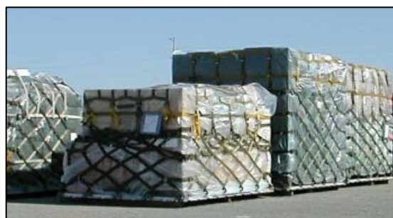
Equipment pallets ready for flatbed loading.