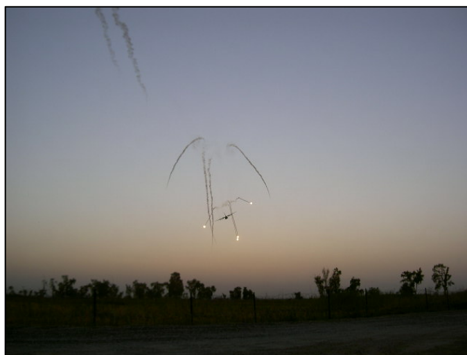
A common event. Camp Griffin was located directly off the end of the runway. C-130s routinely dropped flares on takeoff and landing in and around Camp Griffin.