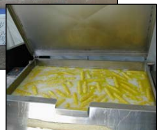
300 dozen ears of Iowa's best sweet corn packed in coolers, flown in straight from Ft Dodge and cooked in our tilt grill!