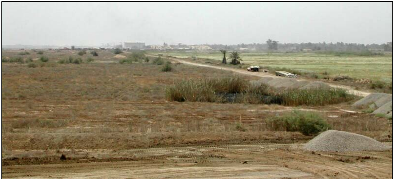
Future site of Camp Griffin – 14 May 2003. Hardened aircraft shelter 4 (where Radar "B" would be placed) is directly in the center of the picture below the horizon. Piles of gravel were spread out to stabilize the ground.

Since the airport had been the scene of a battle three weeks prior, there were fields of unexploded ordinance in the form of sub munitions and abandoned Iraqi ammunition. Air Force Explosive Ordnance Disposal (EOD) team's job was to clear ordinance. Their only means to "clear" fields was a visual search. Since the selected site was covered with grass and crops, a visual search was very risky. The decision was to coordinate with the fire department to supervise a burn to clear all the vegetation of the site. When the area was burned off, numerous explosions announced the locations of live ordinance.