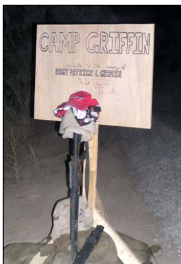
SSgt Pat Griffin's weapon, blouse, helmet, favorite shorts and red cap. (17 May 2003).

Convoy 2 arrived and for the next 90 minutes worked to right the truck and prepare it to be towed to Baghdad. The flipped generator pallet was hooked up to a slick 5-Ton and pulled without any problems. The route was up Highway 1 across Alternate Supply Route (ASR) Orlando around Ad Diwaniyah back onto Highway 8, straight into Baghdad. Just past Ad Diwaniyah, near the exit for Highway 8 the convoy 2 commander took the wrong exit which put the convoy 2 on ASR Orlando heading the wrong direction.