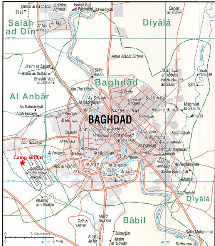
Map depicting the airport and location of Camp Griffin.

When the site survey team arrived, they discovered the US Army "owned" the eastern side of the airport and the Air Force "owned" the western side. The site survey teams looked around the airport and found the only high ground were 8 hardened aircraft shelters (HAS), the main terminal building and a dozen dirt-mound anti aircraft gun emplacements. The CRC had 2 radars and needed 2 sites of "high ground" sufficiently separated. The only available hardened aircraft shelters were number 4 on the northern end and number 4 on the southern end of the ramp. HAS 1, 2, and 3