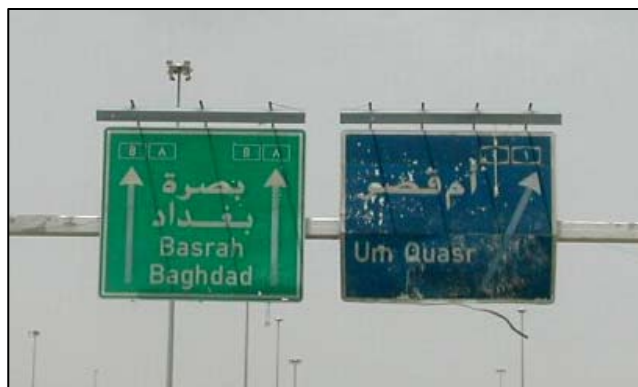
One of the few highway signs not removed by the Iraqis prior to the war. (Highway 8 north of Kuwait border)

The convoy was unlike anything the DEMONS had prepared for. The heat in the vehicles was absolutely unbearable. What little air flow that you could get into the truck was like a blast furnace. The sun was out, no clouds in the sky and the temperature was over well 100 degrees.