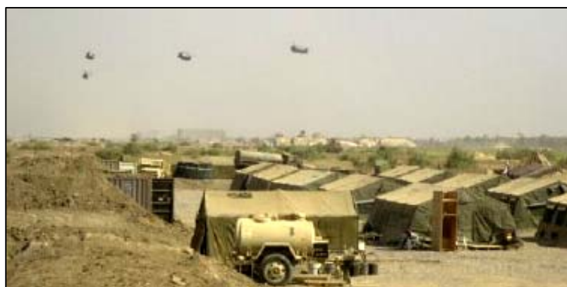
Camp Griffin’s cantonment site, the airport terminal in the background. Note the 25 ft CONEX box bunker built into the Iraqi irrigation berm.

Established and supervised a mobile medical unit (MMU) at deployed location for unit personnel. Performed diagnostic examinations and treated medical and psychological illnesses, injuries and emergencies within scope of care outlined in Command IDMT Treatment Protocols. Provided emergency dental care such as temporary fillings. Administered intravenous fluids and sutured lacerations. Prepared to triage and treat patients in case of mass