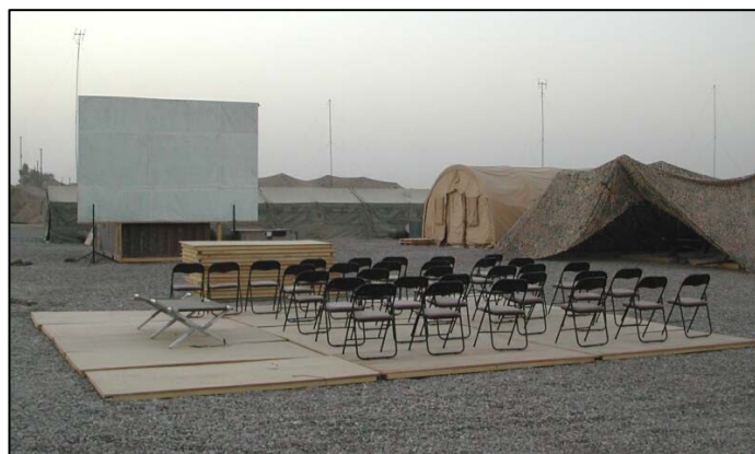
Camp Griffin's "open air" movie theater . . . nothing like watching a movie as tracers fly overhead.

Services performed numerous tasks associated with site construction. Services personnel were responsible for procuring gravel and supervising the layout of gravel on site. Erected living tents, cots, light kits, digging evaporation beds, constructing field sanitation units, port-o-lets, tent floors and volleyball courts. Services personnel were responsible for establishing a cantonment site field feeding system; which fed an average of 215 personnel daily. Erected two mobile kitchen trailers, a dining tent, kitchen tent and positioning six water buffaloes, which were filled daily. A troop support field storeroom was maintained; accounting for $250, 000 dollars of Unitized Group Rations (UGR's), MRE's and bottled water was maintained in a decentralized storeroom and as war ready material.