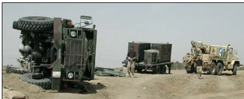
A 5-Ton towing a TQG pallet from Convoy 1 was cut off by an Iraqi car and flipped over just outside As Samawah. The driver was uninjured but shotgun fractured his collar bone (13 May 2003).

Battalion convoy security teams that would escort the convoys to Baghdad. With the security escort embedded within the convoy the final leg to Baghdad was started. The days was just as hot, trucks and mobilizers continued to blow tires. Outside of As Samawah convoy 1 reported a 5-Ton had turned over and they needed convoy 2's wrecker to assist in righting the truck.