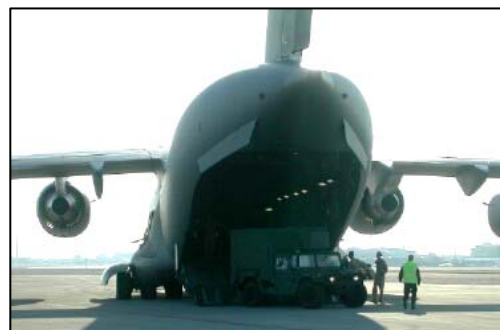
Remote Radio package being loaded on C-17.