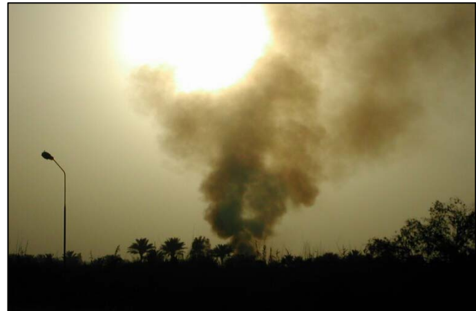
Enemy ammo dump burning half mile north of Camp Griffin.

In the early days the atmosphere at the airport was reminiscent of the “Wild West.” The area had just been liberated only a month earlier and the Army was just setting up patrols around the perimeter. Since there was no established perimeter, it was not uncommon to see Iraqi civilians drive the site. After a few weeks the perimeter was set up and checkpoints posted at the airport gates. Sporadic gunfire could always be heard around the airport, but most was explained as “celebratory fire” or locals trying to keep looters from their property.