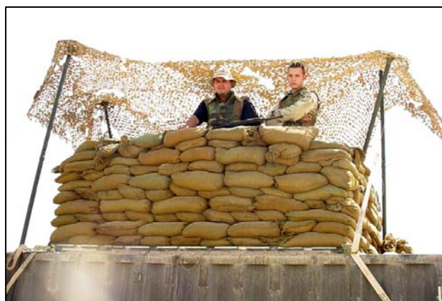
Camp defensive fighting position and observation post.

Security Support – Camp Griffin’s security was manned entirely by DEMONS. Air Force Security Forces personnel (manpower varied between 80 - 120 assigned) NEVER pulled security for Camp Griffin. Air Force Security Forces assigned to the 447 th Air Expeditionary Group consistently reported they were “undermanned” to support