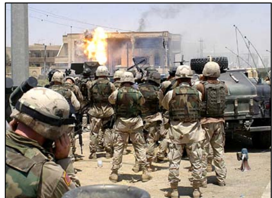
Army attack against Uday and Qusay Hussein.