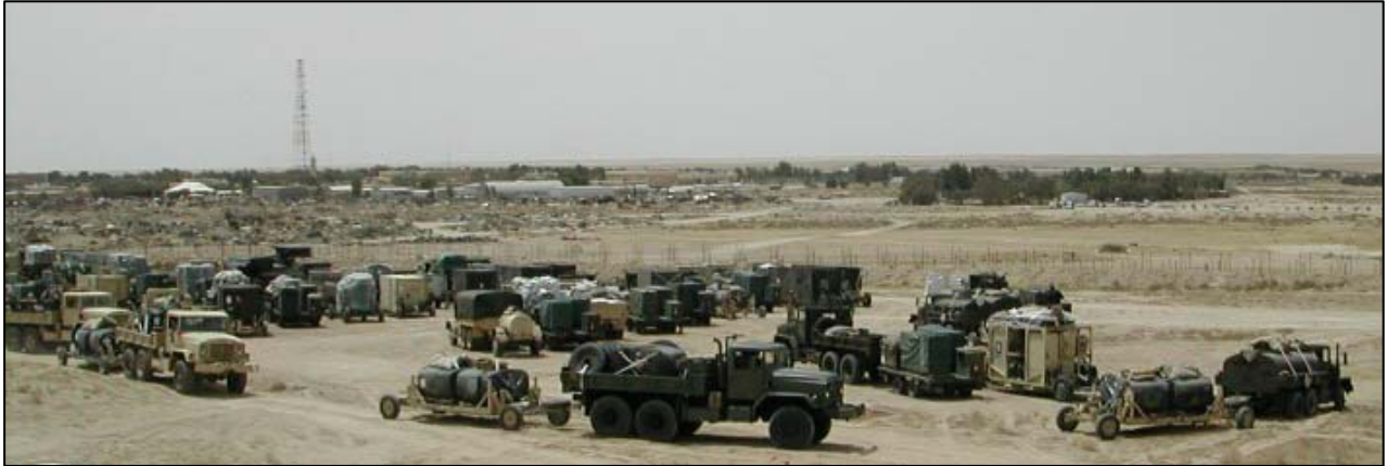
DEMON convoy staging just inside Ali Al Salem AB main gate. Base junkyard and Kuwaiti AF compound behind.

the vehicles and tows. This would later cause some confusion and delays on the morning the convoys departed.