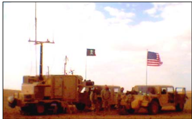
BUG-E operating deep in western Iraq during OIF.

The team members attended numerous meetings on "real estate", Air Traffic Control, frequency management, etc. They were billeted in the office building next to the Baghdad Airport control tower. The building was dubbed the "Crack House." The "Crack House" housed a mix of U.S. Air Force, U.S. Army, Royal Australian Air Force, and U.S. Navy personnel. In the early days of occupation, "billeting" was the term used for allowing the team to bed down in the women's latrine.