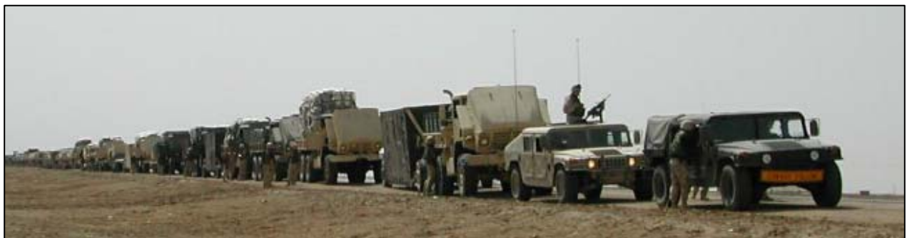
Convoy 2 pulled off the side of Alternate Supply Route Jackson outside of Al Samawah, Iraq. (13 May 02).

The plan to get the equipment and troops from Kuwait to Baghdad was to have two separate convoys for 93 vehicles, 70 tows, and 264 troops.