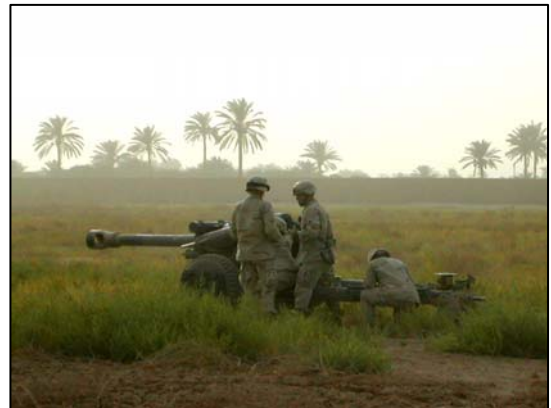
Fire Team from 82 nd Airborne's 105mm counterbattery, Camp Griffin's closest neighbors.