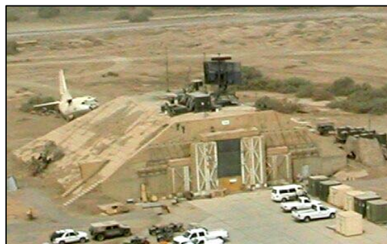
Radar “B” set up on top HAS 4, Combat Search and Rescue squadron set up inside the HAS.