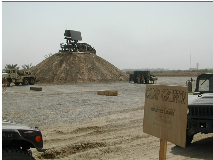
Camp Griffin taking shape, radar "A" unfolding - 17 May 02.

One concrete block structure, the command and control building for the SA-9 site was fairly new and in good shape and was cleaned out to house the DEMON Operations Center.