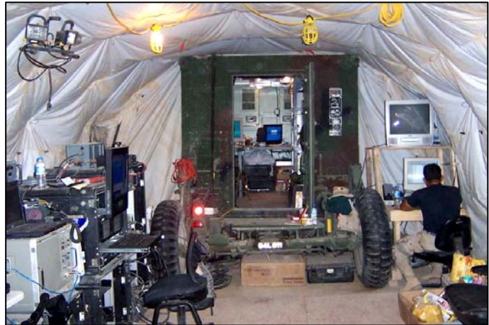
J-Cell - JTIDS module backed into a tent.

The J-Cell was a unique entity because it is the only work center on Camp Griffin where operators and maintainers work hand-in-hand with each other on a daily basis. Typically, there are two Digital Maintenance Technicians and two or three Interface Control Technicians working during a shift. This is a rare opportunity for the operators and maintainers to see how their counterparts work; and an opportunity to gain knowledge and experience from each other.