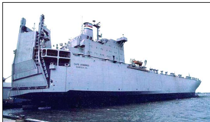
M/V Cape Domingo bringing DEMON vehicles home.

A team of 16 DEMONS returned to Kuwait to receive the 72 trucks and tows released from theater. They process, wash and loaded them on to the M/V Cape Domingo (T-AKR 5053, one of Military sealift Command's Roll-on/Roll-off ships). The trucks arrived at the Port of Charleston and were shipped via commercial flatbed to Eglin's TMO yard, the same spot where they began their trip 15 months earlier.