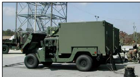
Prototype Remote Radio Vans

The unit packed almost every piece of equipment on the books, to include the kitchen sinks (Mobile Kitchen Trailers - MKTs). The packing took place around the clock and took almost a week. The Unit's (Quality Assurance – QA) line inspected the loaded pallets and trucks in 2 days. As per ACC/DOYG, this was the largest (in size and weight) of any ACS deployment.