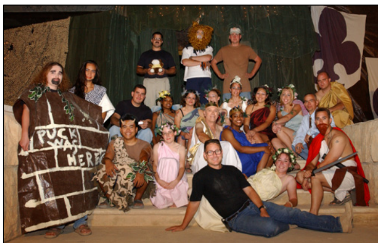
Camp Sather's "A Midsummer Night's Dream" cast and crew.

Camp Griffin's fabrication tent (sewing machines) were used to sew many of the costumes. Desert camo was donated to construct the stage's backdrop.