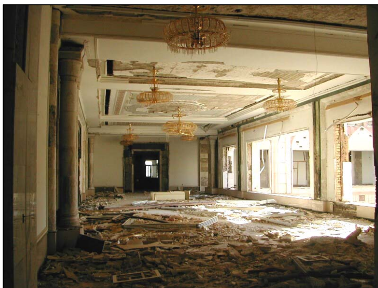
Marble from the Ba'ath Party Palace was a very popular souvenir.

CENTAF announced that 3 day R&R trips to Al Udeid AB, Qatar would be made available for forward units that had been in theater greater than 100 days. The trips were designed to be 3 day/2 night stays. The only Air Force unit stationed at the Baghdad Airport that had been deployed long enough was the 728 th . The first trips began 11 Sep 03 and they were flown to Al Udeid via C-130s. The pizza and beer was definitely the highlight of the trip along with being able to rest in safe environment. In the end about 55 DEMONS participated in 5 R&R trips. For those DEMONS that wanted to take the down time but did not want to go to Al Udeid they were given the same amount of time off to at Camp Sather.