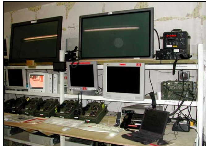
Ops Center inside Iraqi command and control building.

A few weeks later the first mortars fell on Camp Seitz (Army Logistics Base) just outside “Charlie Gate” north of Camp Griffin. Charlie Gate was one of the few gates onto the airport and the nearest checkpoint to Camp Seitz. Just north of Camp Seitz is the Baghdad suburb of Abu Ghuraib. The majority of the attacks on the airport came from that area. The enemy found they could fire mortars and RPGs into the airport and camps and escape into the village without the threat of being attacked. The “hit and run” tactics increased to the point it was a daily (mostly dusk and dawn) occurrence. There were always plumes of smoke on the horizon, the sound of explosions and gunfire was ever present. DEMONS got pretty good at recognizing the difference between AK-47, M-16, M-240, M-2, 25mm fire, mortars explosions (incoming), 105mm fire (outgoing) and huge IED explosions along Route Irish a few miles north.