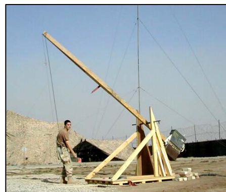
Another successful trebuchet firing.

Ground Radio also successfully designed and constructed a trebuchet, a middle age catapult capable for throwing bricks (or MREs) over Camp Griffin's south Hesco barrier wall. Bricks were the preferred choice of "ammo" since they weighed more than MREs and would go farther.