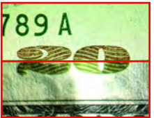
Copper to green color-shifting ink