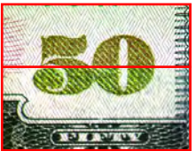
Copper to green color-shifting ink