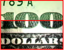
Green to black color-shifting ink